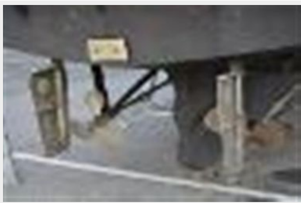
Props & rudders