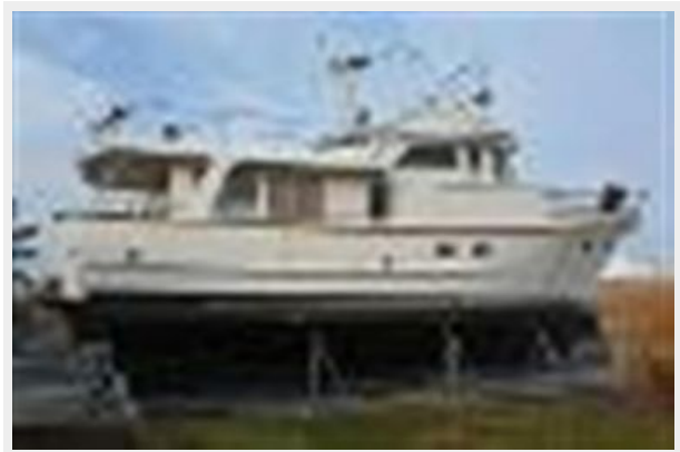
Hauled & Blocked Dec. 2014