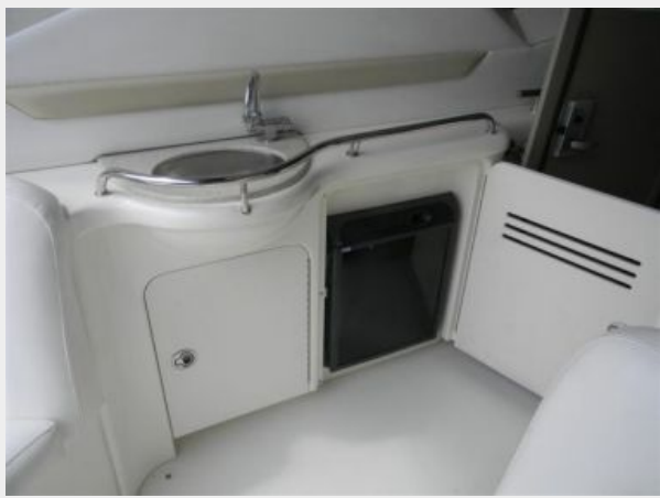
Cockpit Wetbar & Refrigerator