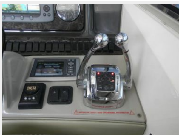
Helm Controls & Electronics