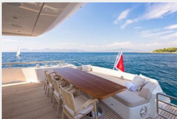
Aft deck table and seating