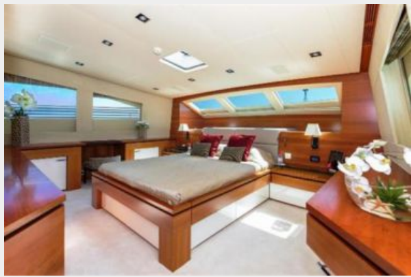
VIP - on main deck