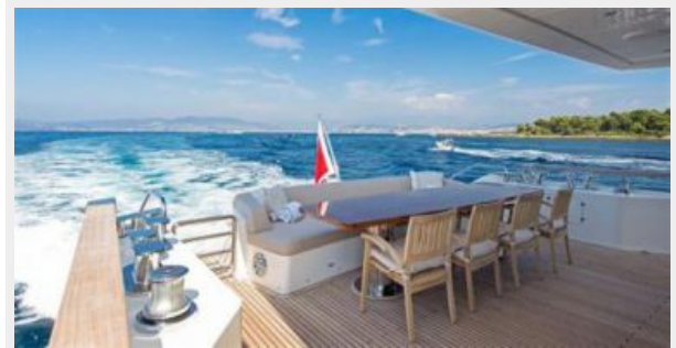
Large aft deck