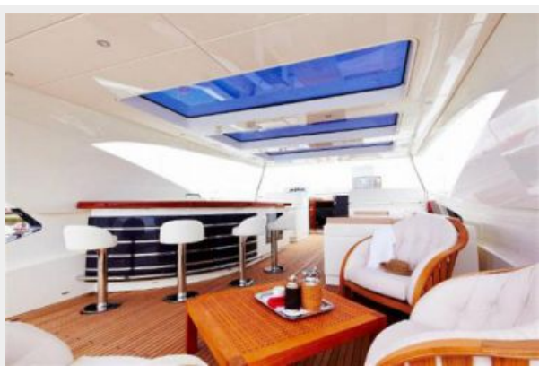
Flybridge bar and lounge area