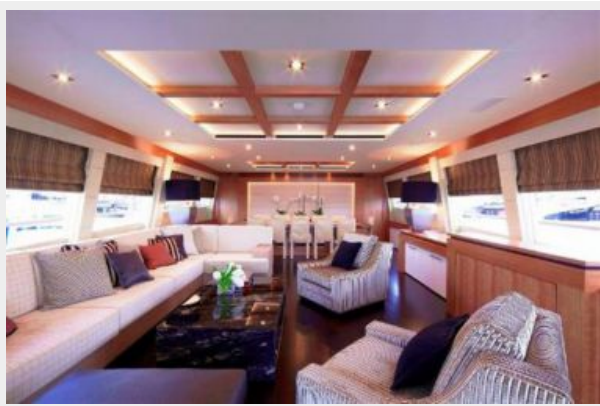
Salon to forward