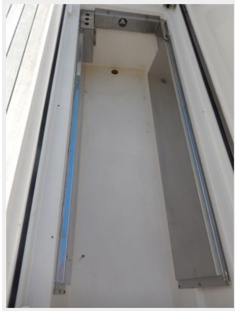
CP Freezer fish box