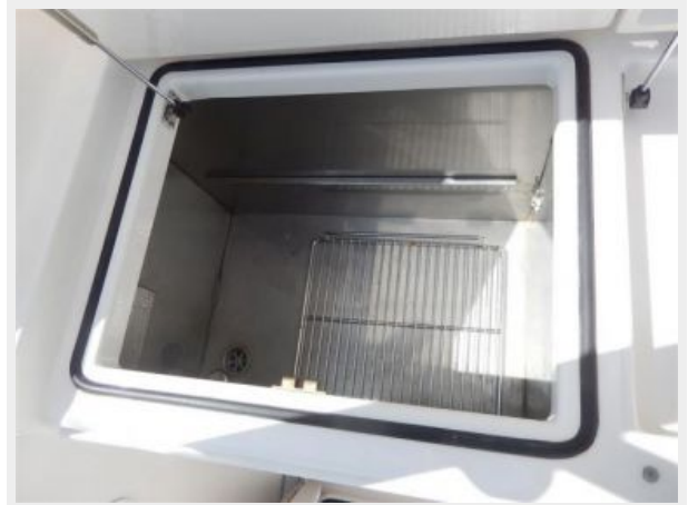
CP Bait freezer