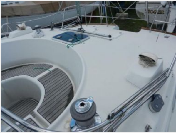
Center cockpit and aft deck