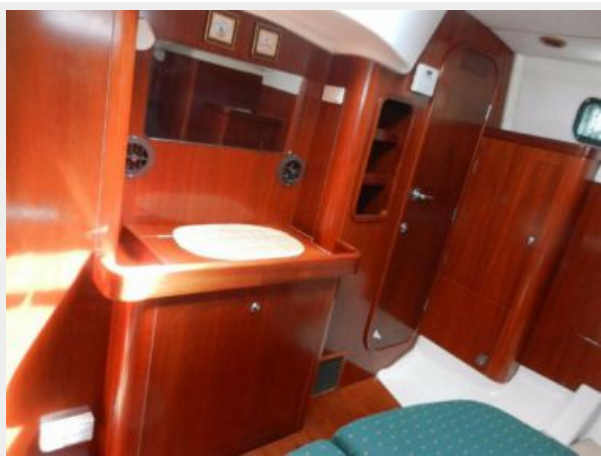
Aft cabin view 2