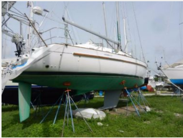
In yard storage