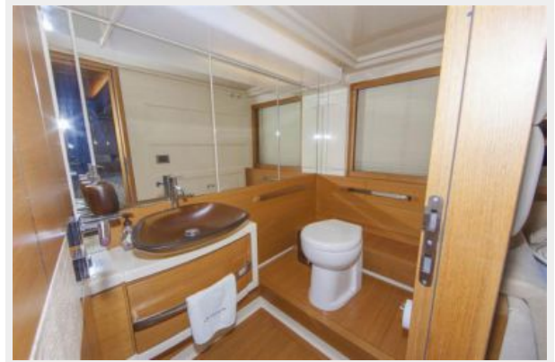
Master Stateroom Bath