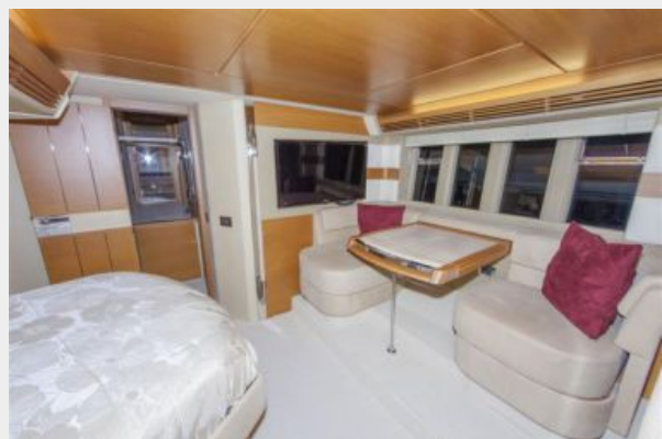
Master Stateroom Settee