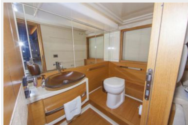
Master Stateroom Bath