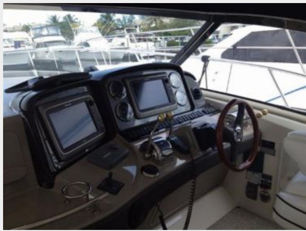
Helm Control View