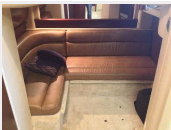
Guest Stateroom/Mid-Berth 2