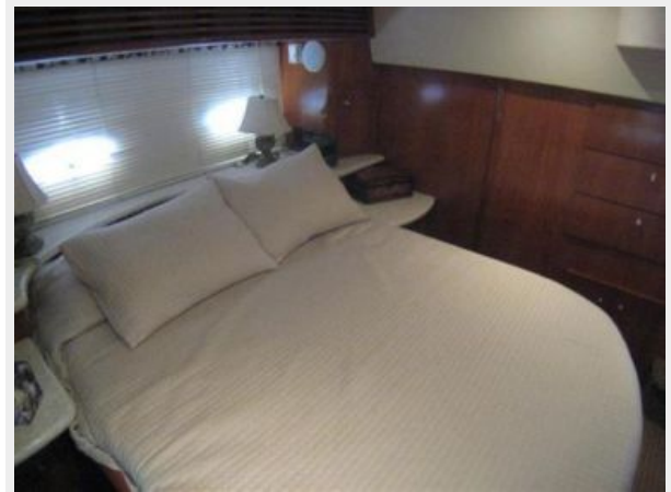
Master Island Berth