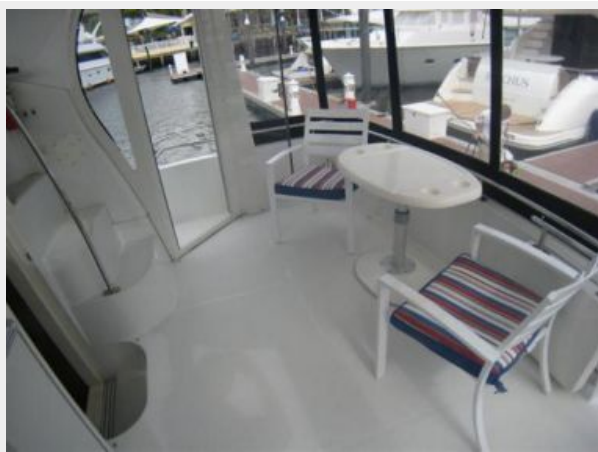
Sundeck to starboard