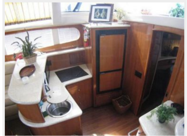
Galley to port