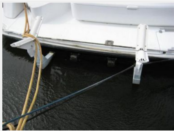
Hydraulic Dinghy Lift