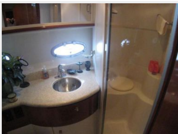
MSR Ensuite Head & Shower