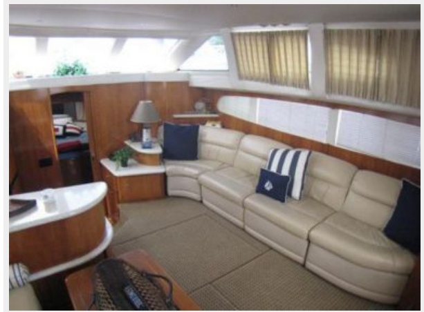
Salon to starboard