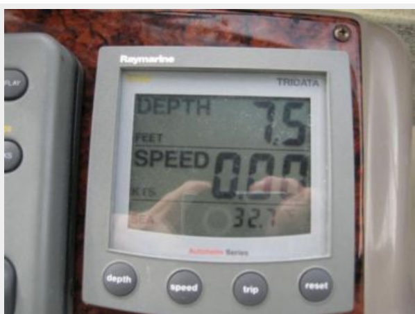
Raymarine ST60 Autohelm Series