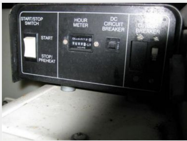
Genset hours - 3500