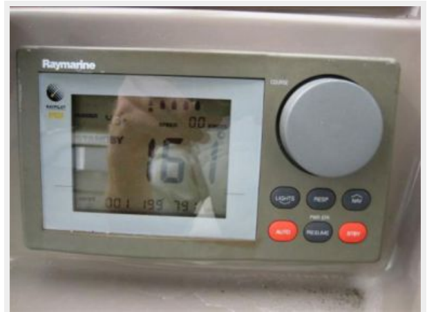
Raymarine RP650 Autopilot