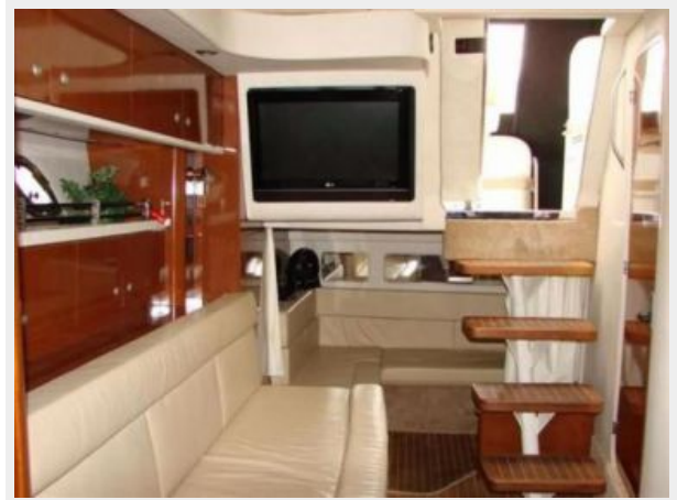
Aft Jump seat