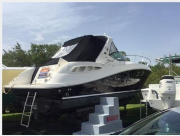
Aft Deck Dining Table