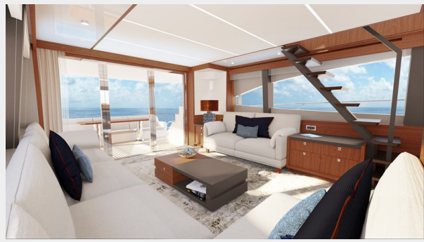
Salon looking aft