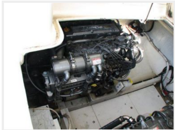
Engine & Mechanical Equipment 2 - Port Engine