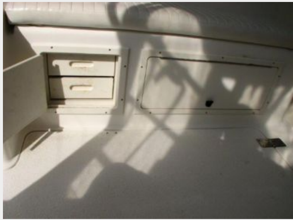
Deck 5 - Helm Storage