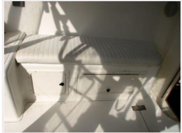
Deck 6 - Port Engine Seating