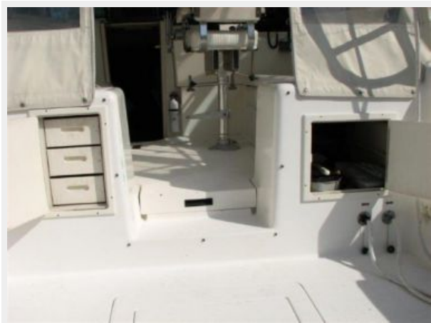
Cockpit / Fishing Equipment 2 - Cockpit Storage