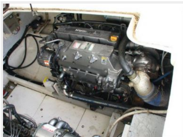
Engine & Mechanical Equipment 3 - Starboard