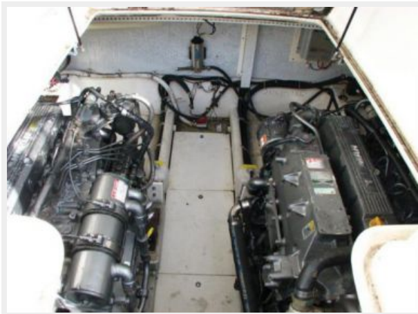
Engine & Mechanical Equipment 1 - Engine Room