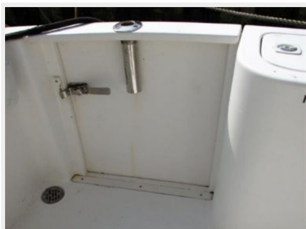
Cockpit / Fishing Equipment 4 - Tuna Door