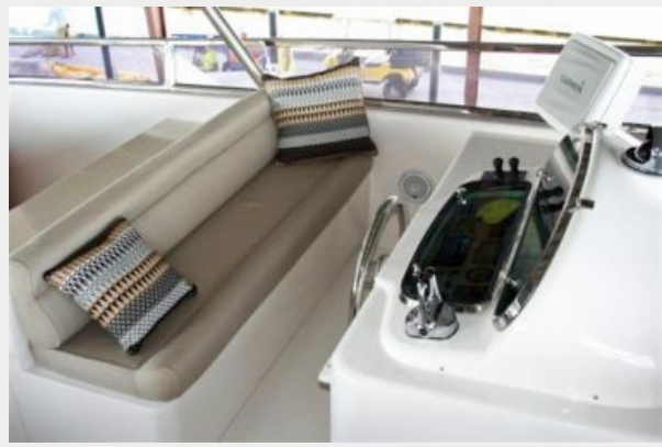
Flybridge Helm _Seating