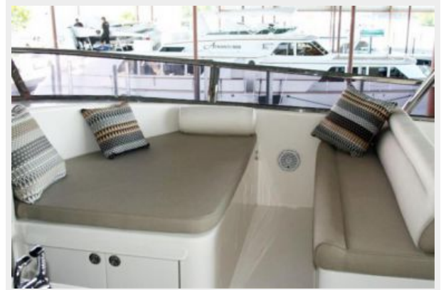
Flybridge Bench Seat_Sun Pad