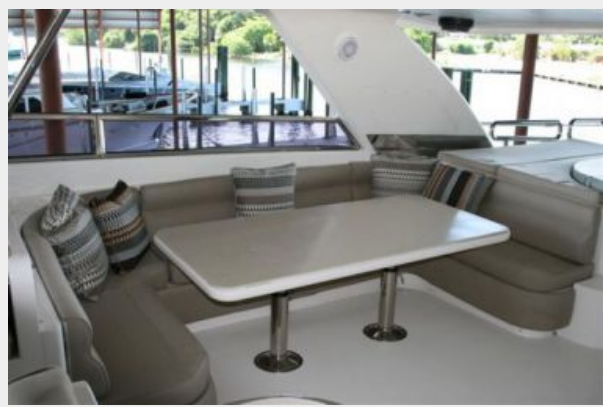
Flybridge Table _Seating