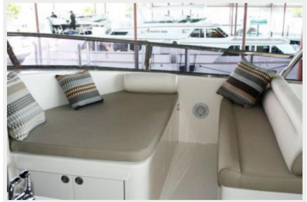
Flybridge Bench Seat_Sun Pad