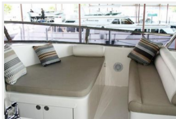
Flybridge Bench Seat _Sun Pad