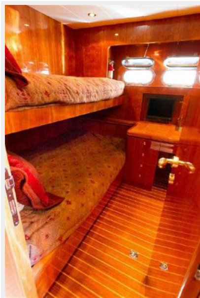
Aft Stateroom Crew