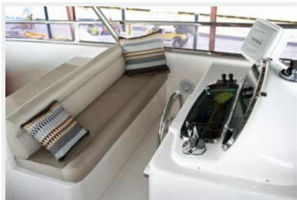
Flybridge Helm _Seating