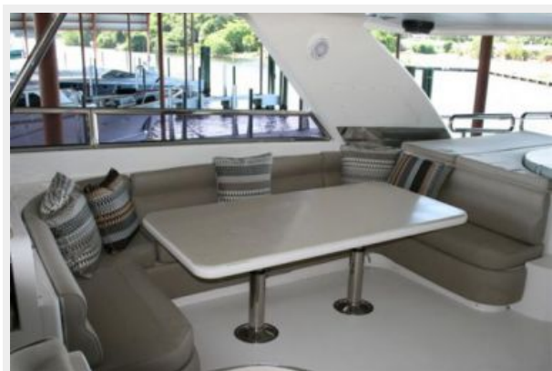
Flybridge Table _Seating