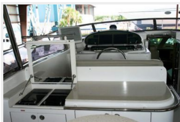
Flybridge Jacuzzi _Sun Pad