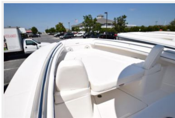
Sunbed w/ Seatbacks