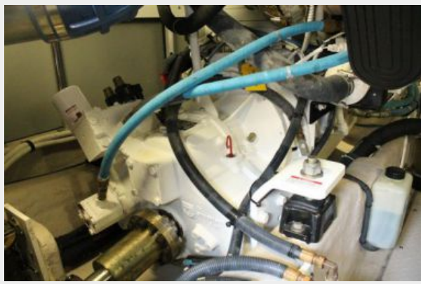
Starboard Shaft Seal, AC Intake & Fresh Water Supply