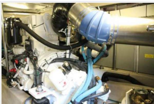
Clean Bilges & Raw Water Strainers