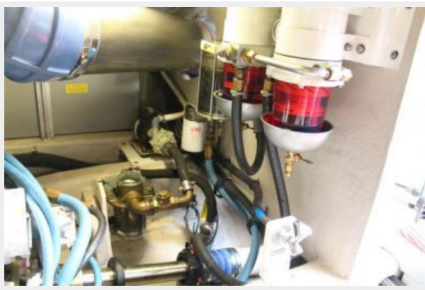
Starboard Dual Racors with Pressure Gauge