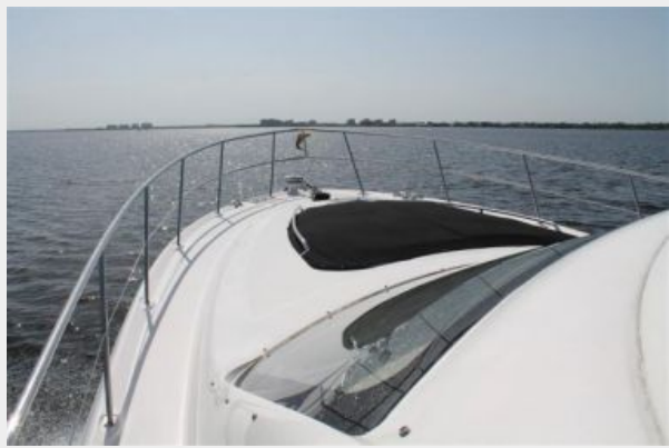
Anchor, Windlass & Spotlight