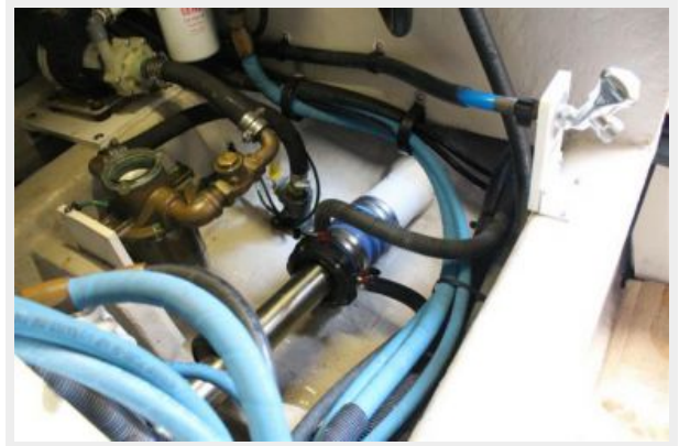
Starboard Shaft Seal, AC Intake & Fresh Water Supply