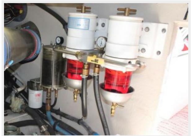
Starboard Dual Racors with Pressure Gauge