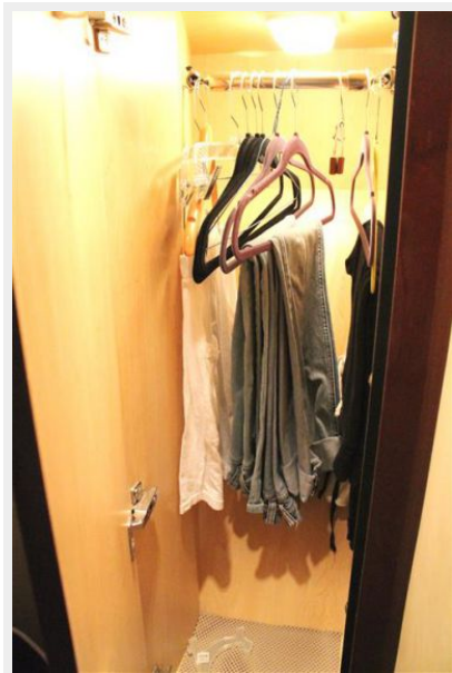
Starboard Hanging Locker