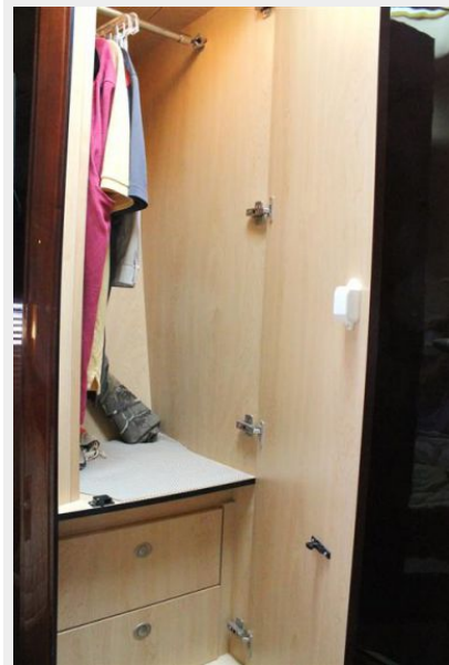
VIP Hanging Locker