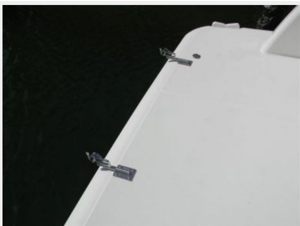
Weaver Snap Davit System