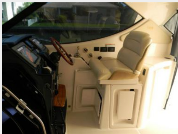
Helm Seat & Helm Overview