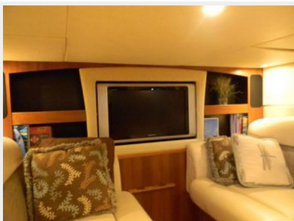
Media Room TV & Book Shelves