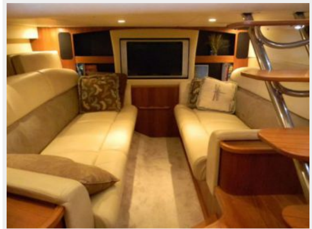
Mid-Cabin Media Room