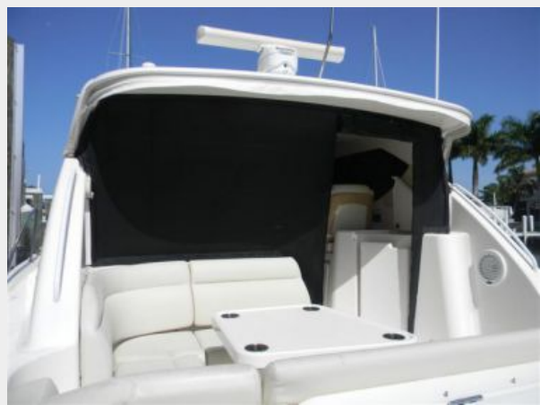
Custom Mesh Drop Curtain