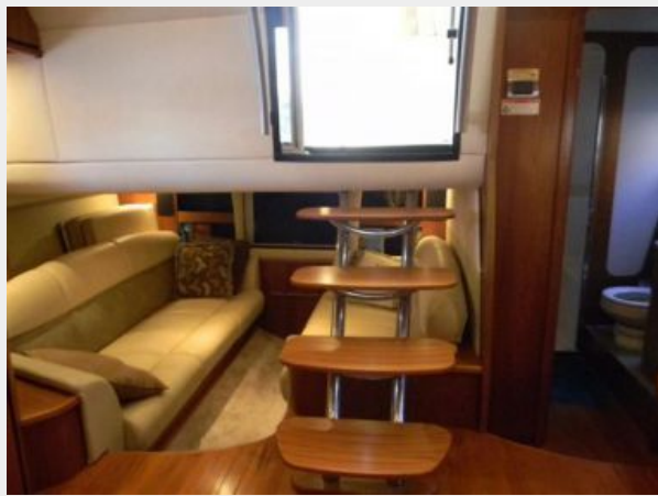
Entry from Cockpit