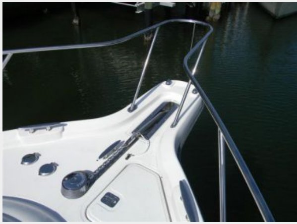
Intergrated Bow Pulpit