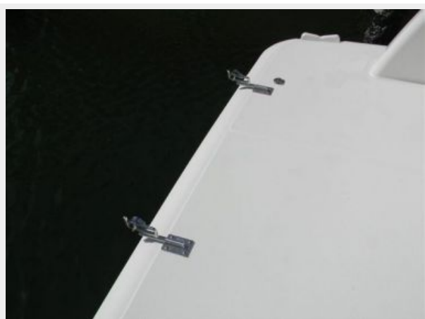
Weaver Snap Davit System