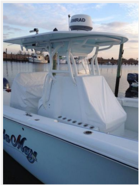
Cockpit / Fishing Equipment 1 - Key West Console Rod Holders