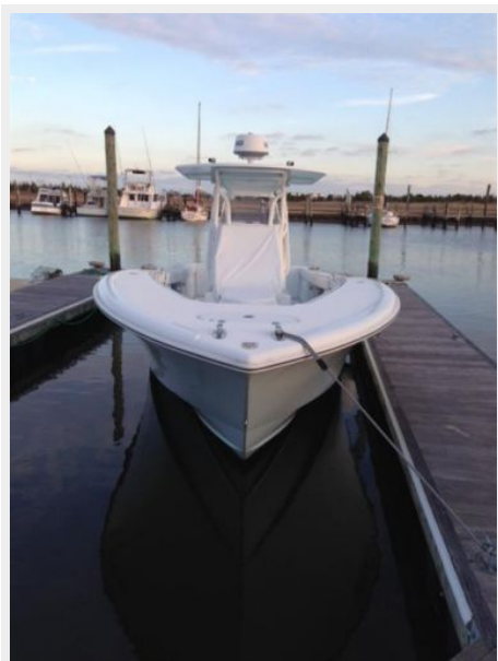
Deck 1 - Bow