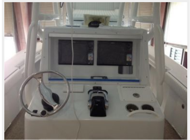
Center Console / Electronics & Navigation