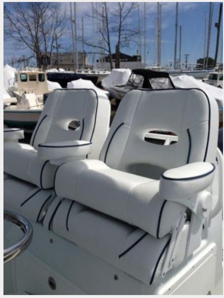
Deck 3 - Lebroc Chairs