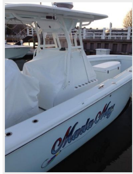
Deck 4 - Covers