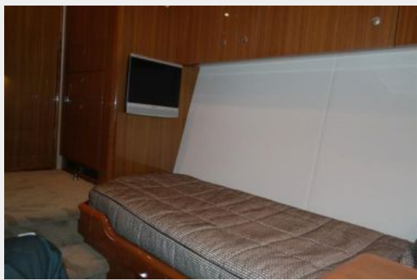
Aft Starboard Stateroom