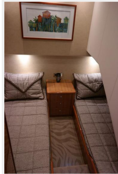
Aft Starboard Stateroom Locker