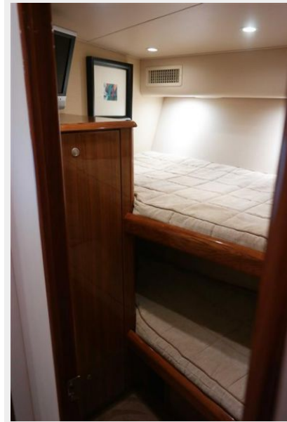
Forward Starboard Stateroom