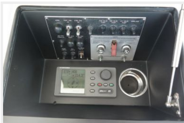
Starboard Radio Box