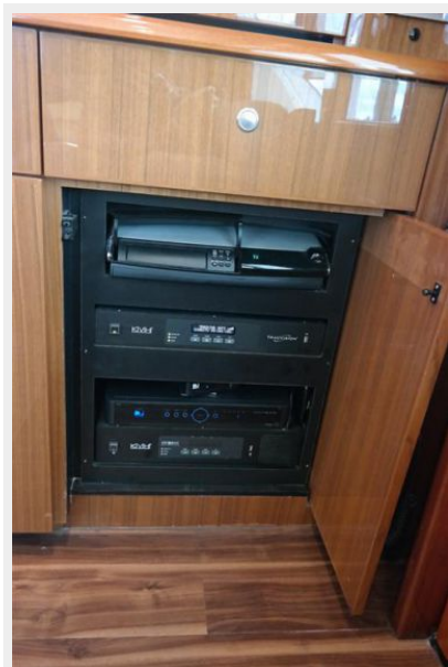
Salon A/V Equipment