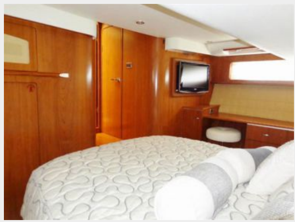
Master Stateroom TV