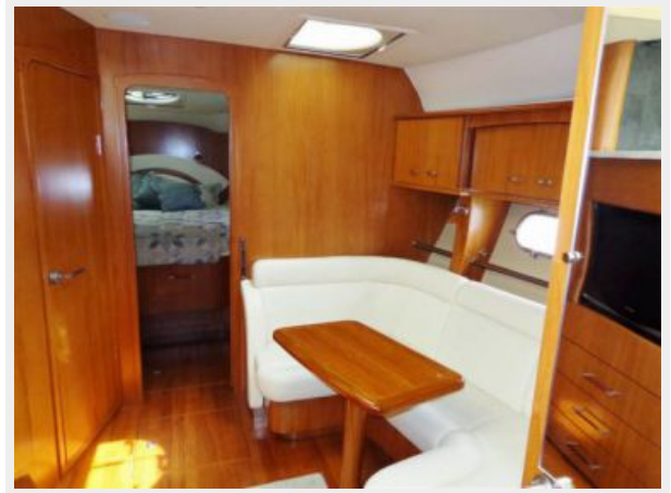
Lower Salon TV