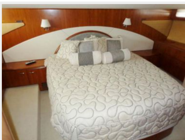
Master Stateroom Settee