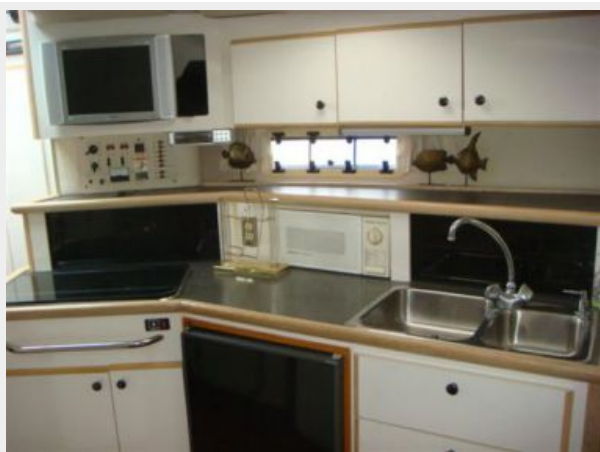
32' Maxum Galley Photo2