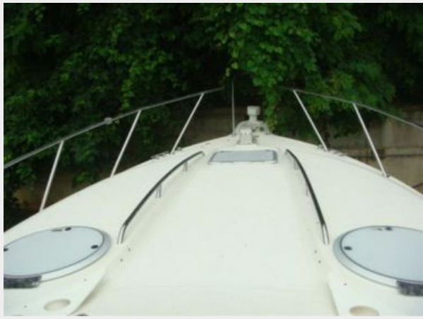
32' Maxum Foredeck