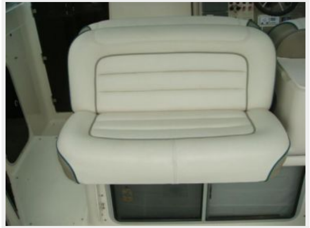
32' Maxum Upper Deck Forward Seating