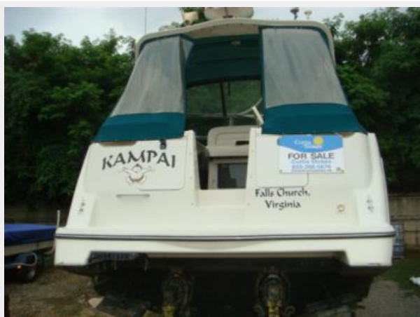
32' Maxum Aft Profile