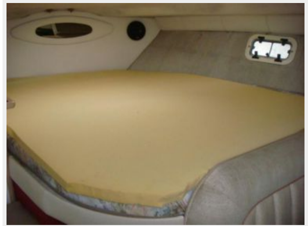
32' Maxum Master Stateroom