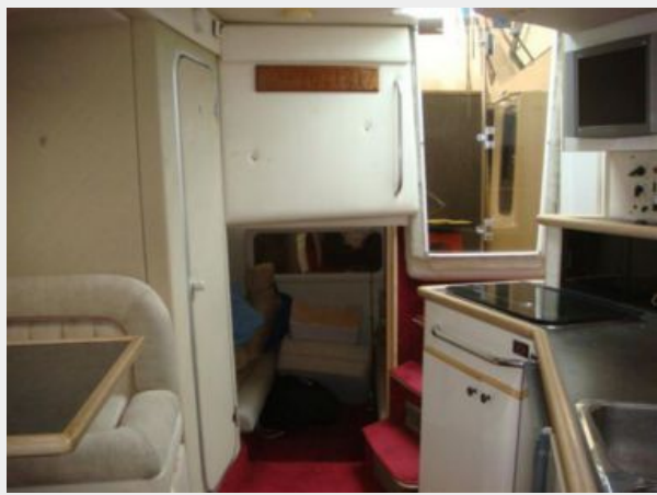
32' Maxum Lower Deck Aft