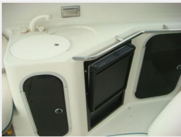
32' Maxum Upper Deck Wetbar