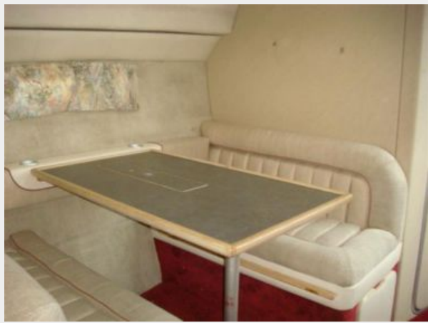
32' Maxum Dnette Photo2