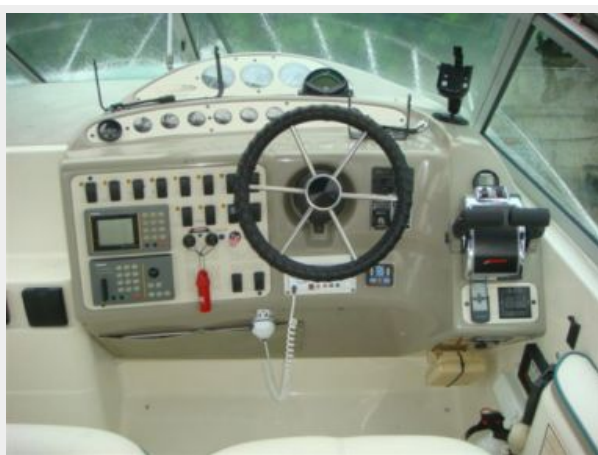
32' Maxum Helm Photo2