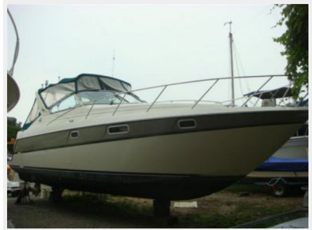
32' Maxum Starboard Forward Profile