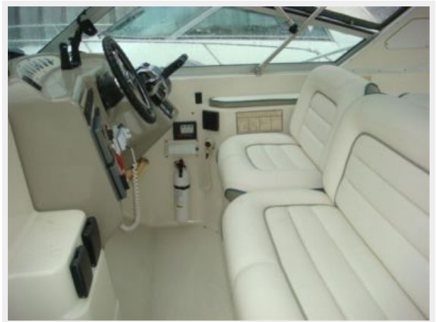
32' Maxum Helm Photo1