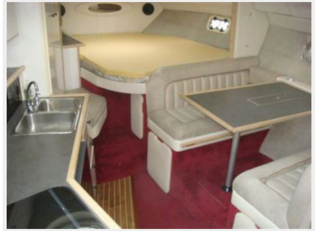
32' Maxum Lower Deck Forward