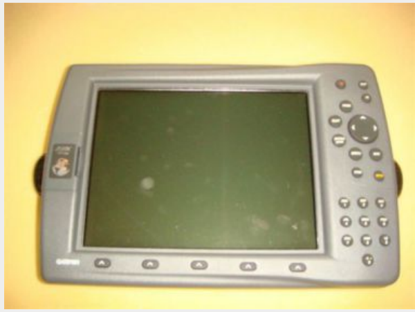
32' Maxum Helm Chartplotter