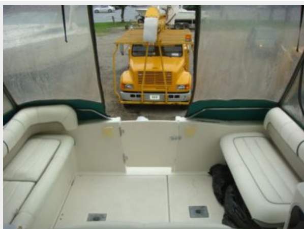
32' Maxum Upper Deck Aft