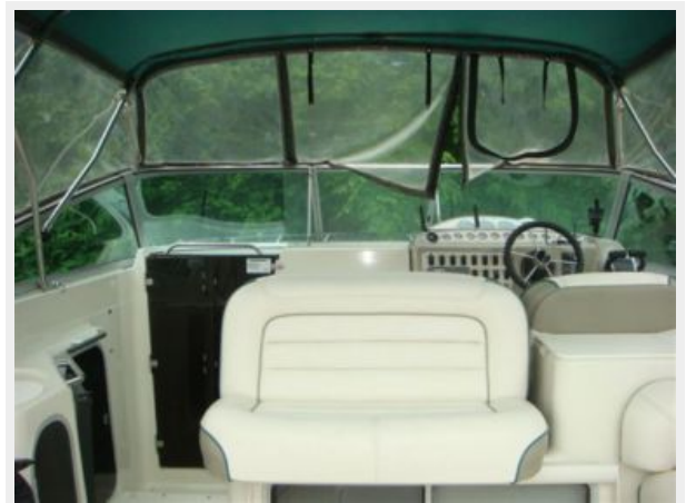
32' Maxum Upper Deck Forward