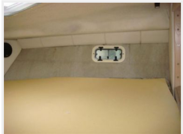
32' Maxum Master Stateroom Starboard