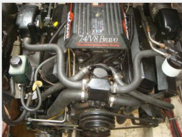
32' Maxum Starboard Main Engine