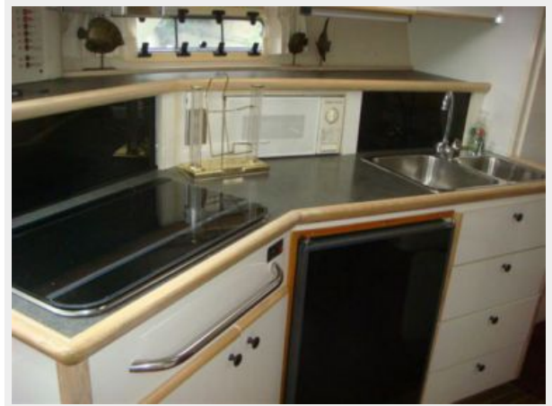
32' Maxum Galley Photo1