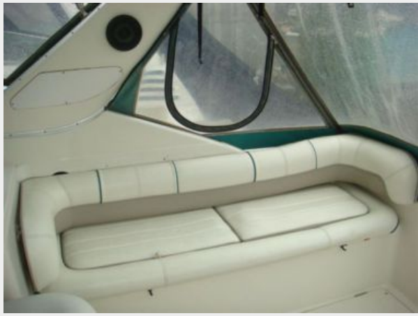
32' Maxum Upper Deck Starboard