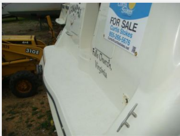
32' Maxum Swim Platform