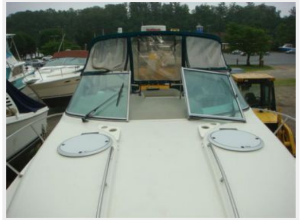
32' Maxum Foredeck Aft