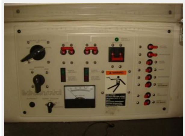
32' Maxum Electrical Panel