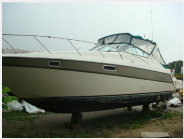
32' Maxum Port Forward Profile