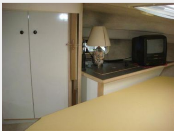
32' Maxum Master Stateroom Port