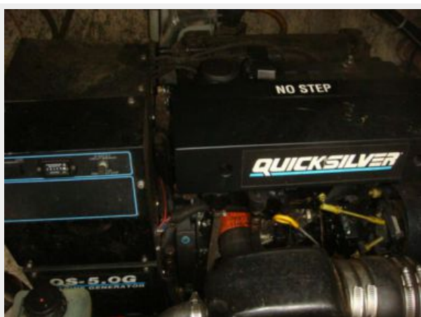
32' Maxum Generator