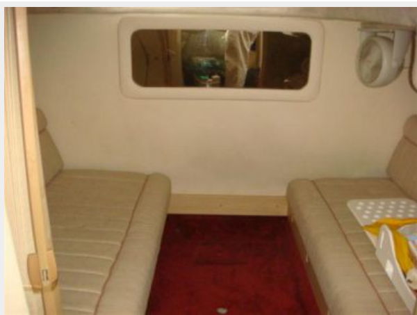
32' Maxum Aft Stateroom