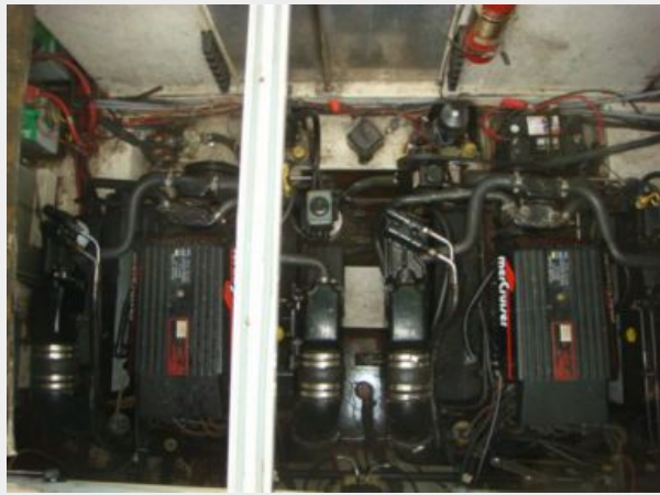
32' Maxum Engine Room