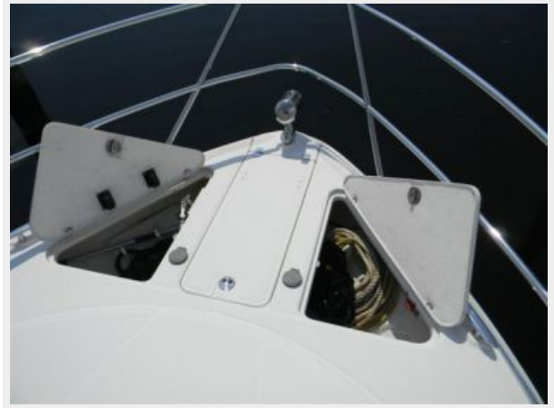
Anchor Locker Storage