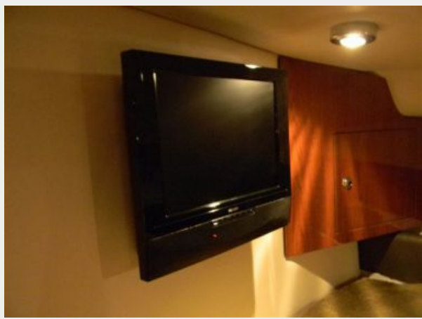
Master Stateroom TV