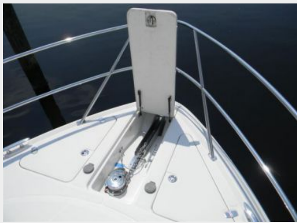
Recessed Anchor and Windlass