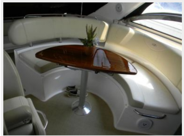
Cockpit Table & Settee