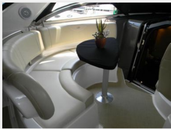
Cockpit Table & Cover