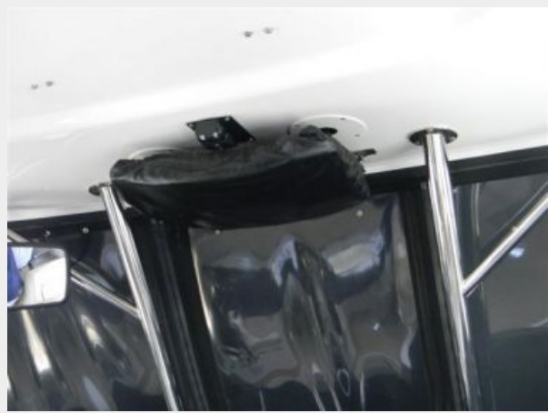
Cockpit TV in Stored Position