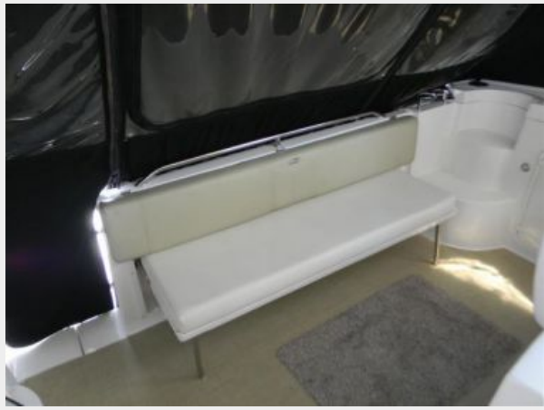
Aft Cockpit Bench Seat