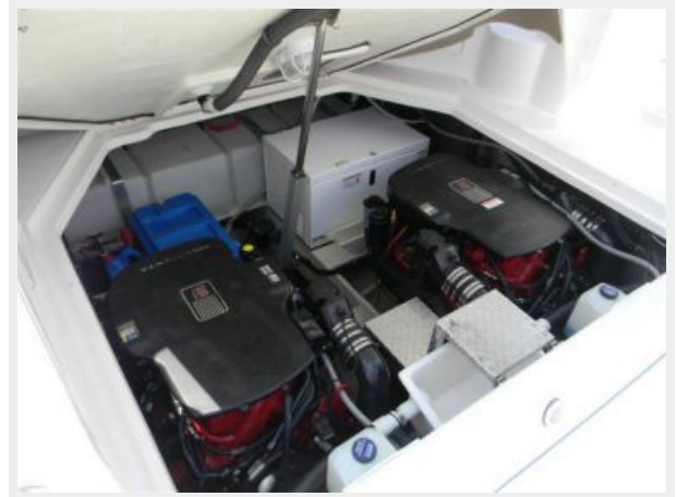
Engine Room 2