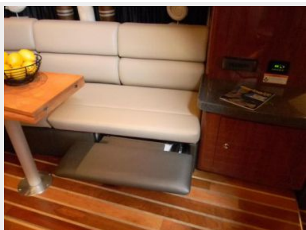
Foot Rest-Salon Couch