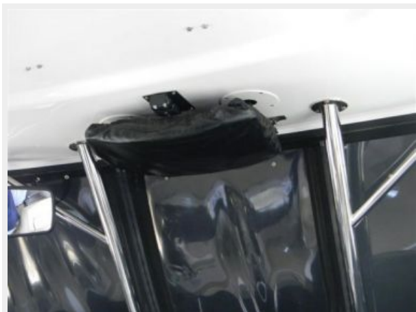
Cockpit TV in Stored Position