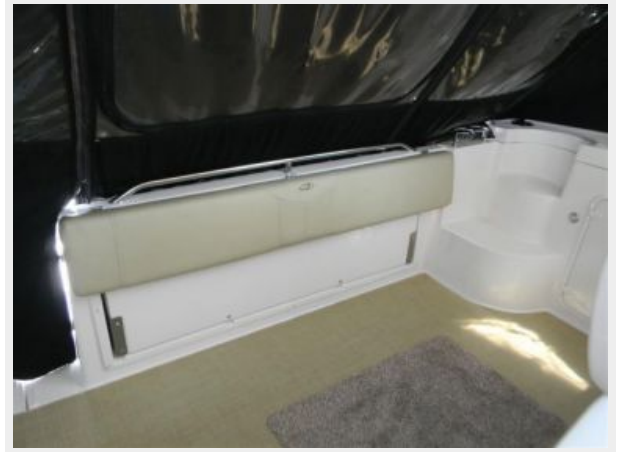
Aft Cockpit Bench Seat - Folded Away