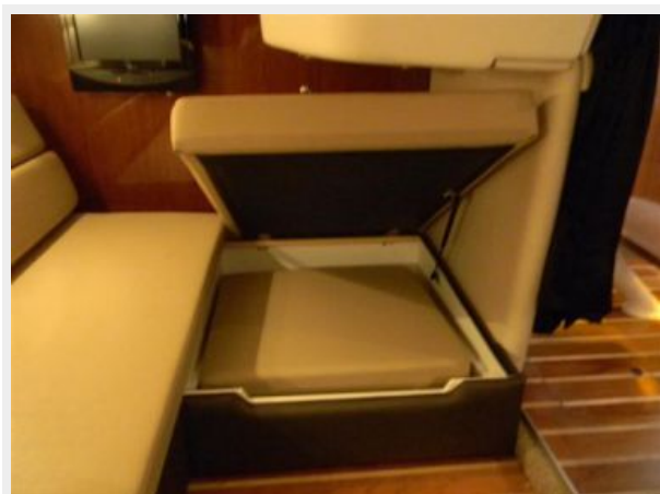
Filler Cushion for Mid Stateroom