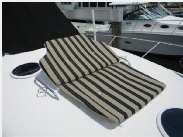
Foredeck Chaise Lounge