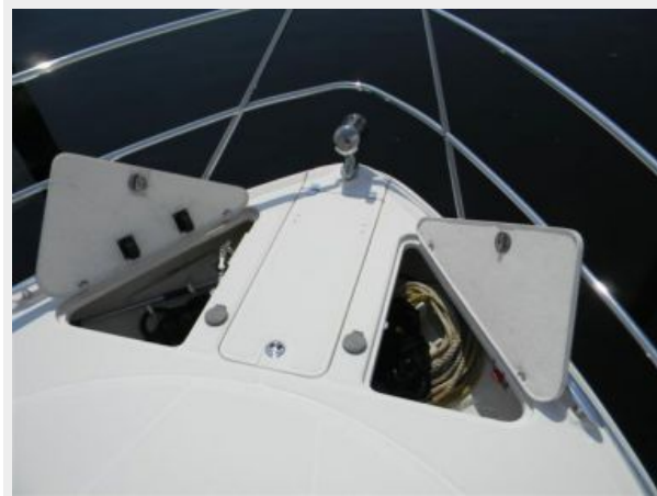
Anchor Locker Storage