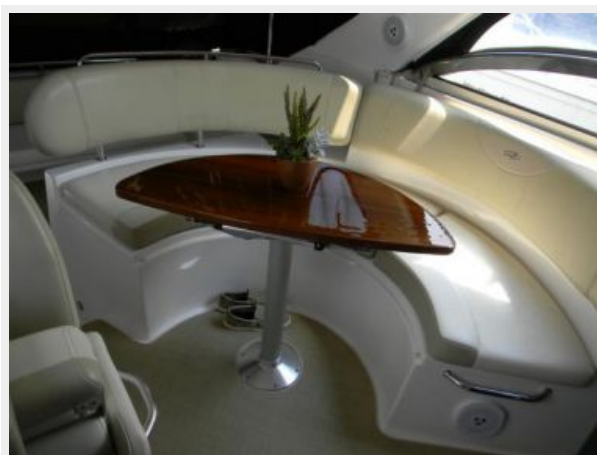
Cockpit Table & Settee