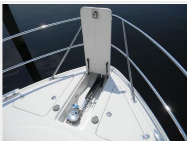
Recessed Anchor and Windlass