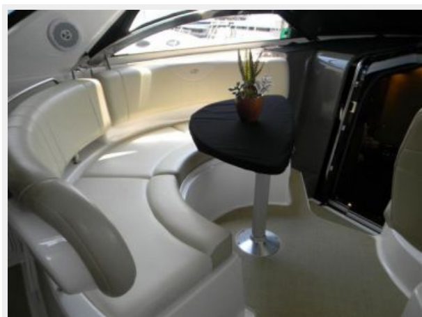
Cockpit Table & Cover