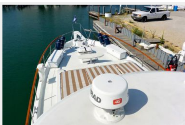
Bow with Twin Dunnage Box