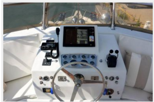
Flybridge Helm - Updated Electronic Controls