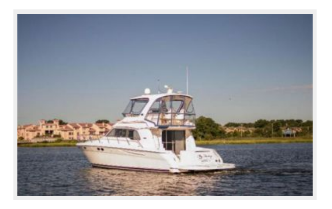
Port Side Stern