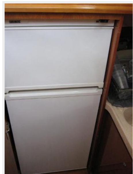
Refrigerator / Freezer