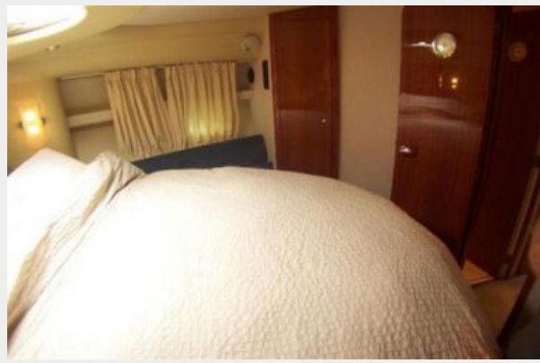
MSR to starboard