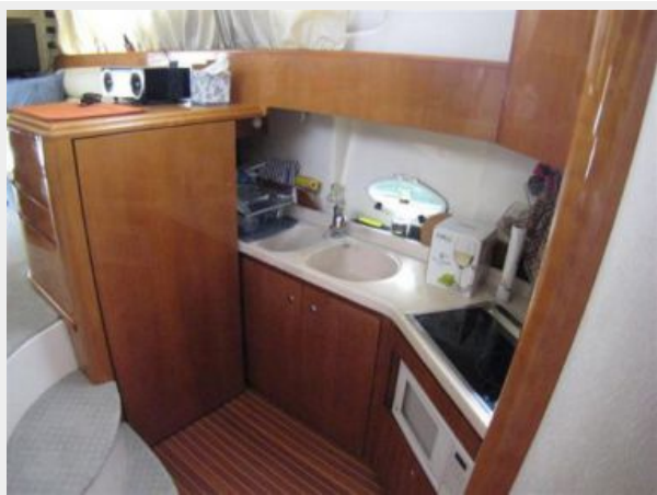
Galley to port