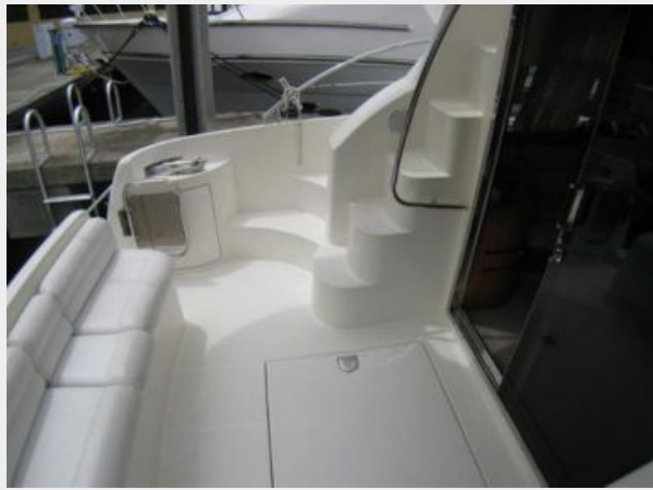
Aft Cockpit Portside