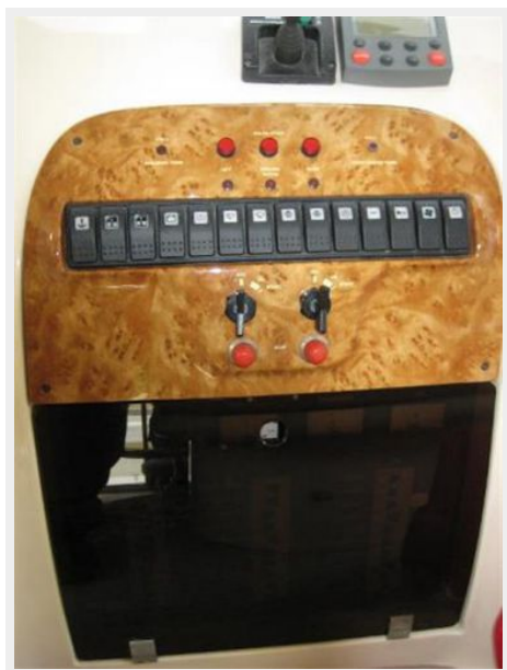
Lower Helm Switch Panel