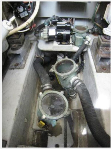
Engine Room - forward