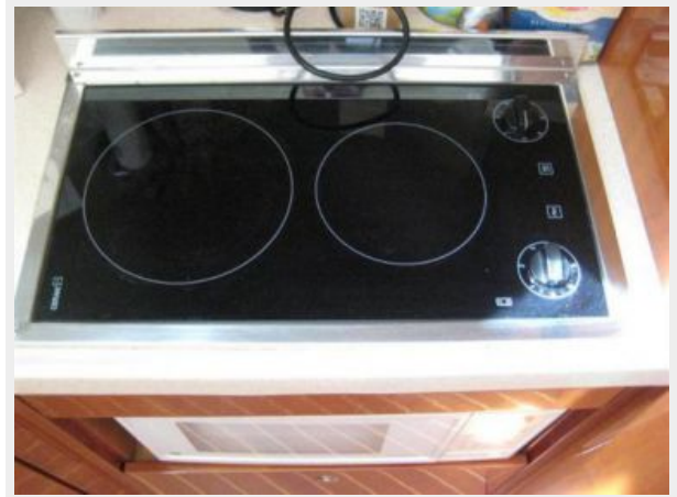
Two-Burner 110v Stove