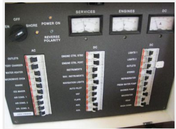
AC/DC Panel at Lower Helm