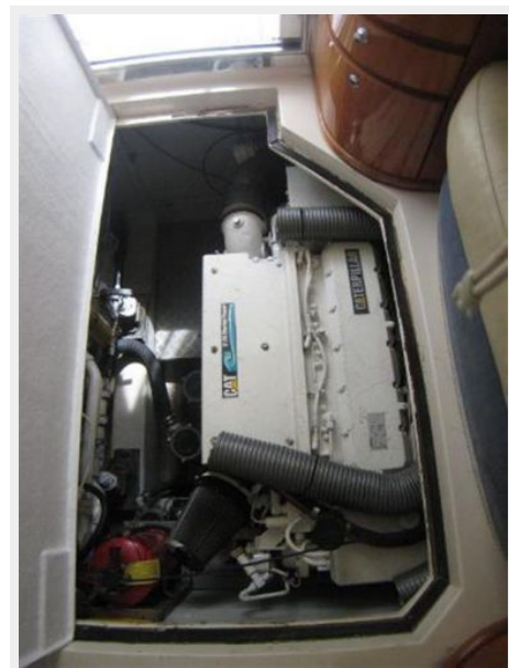
Engine Hatch in Salon