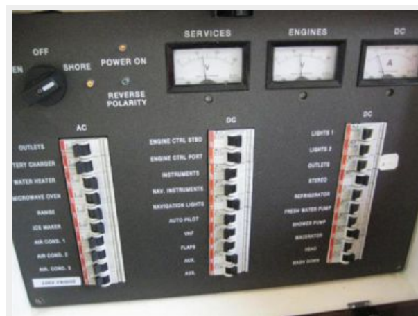
AC/DC Panel at Lower Helm