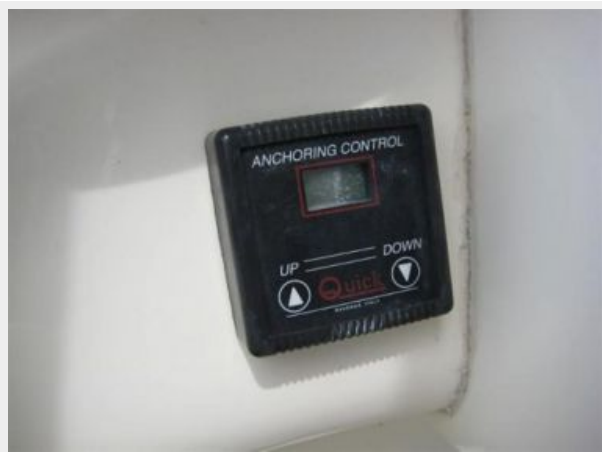
Anchor Control in Flybridge