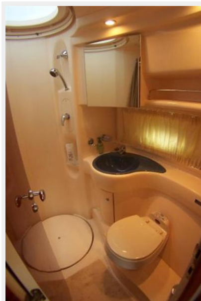
MSR Head & Shower