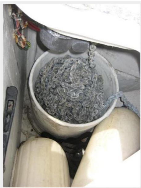
All Chain Rode in Anchor Locker