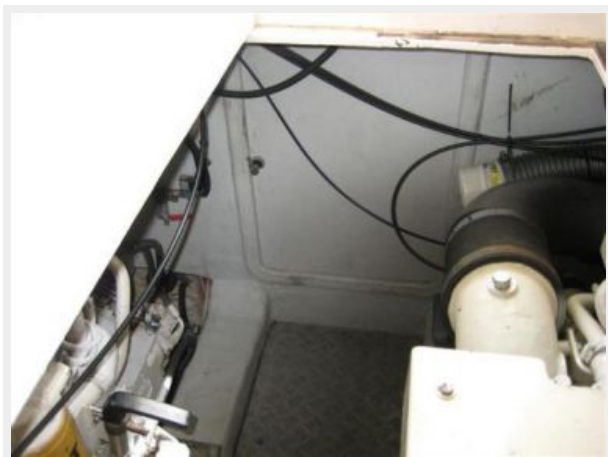
Aft Engine Room Door to aft Lazarette