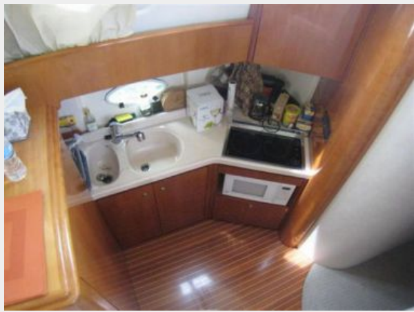
Galley down to port