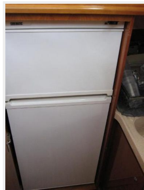
Refrigerator / Freezer