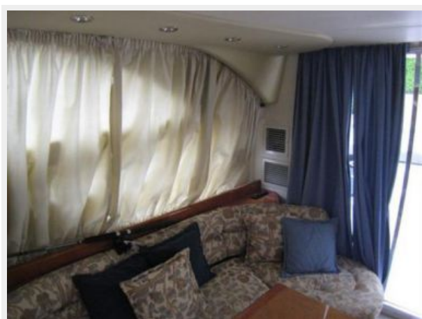
Cabin to aft starboard