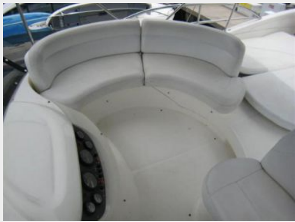
Starboard Seating in Flybridge