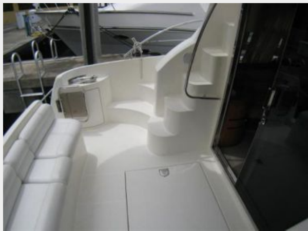
Aft Cockpit Portside