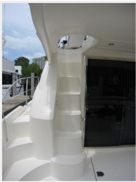
Molded Stairs to Flybridge