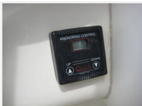
Anchor Control in Flybridge