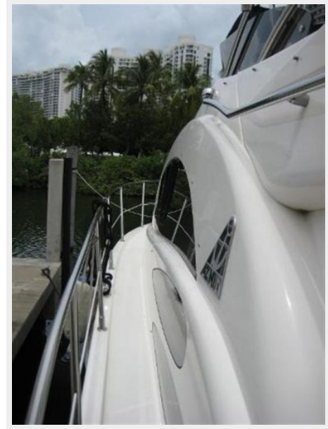
Port Side Deck