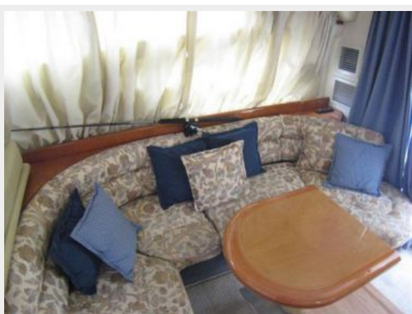
Salon Settee to starboard