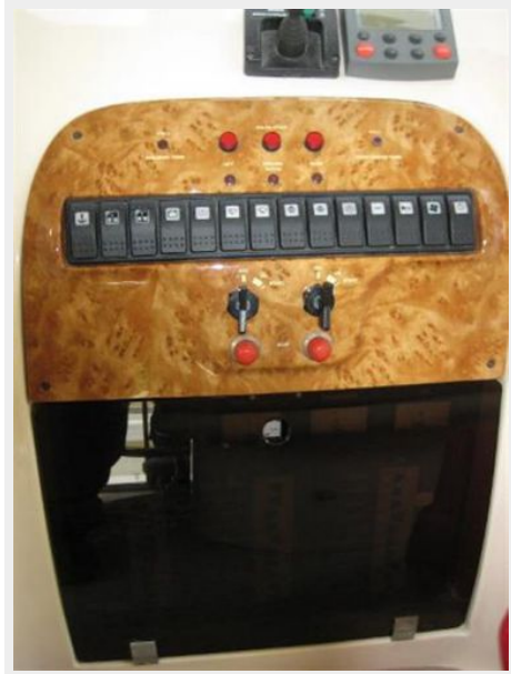
Lower Helm Switch Panel