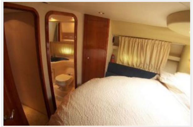
MSR to port with ensuite Head & Shower