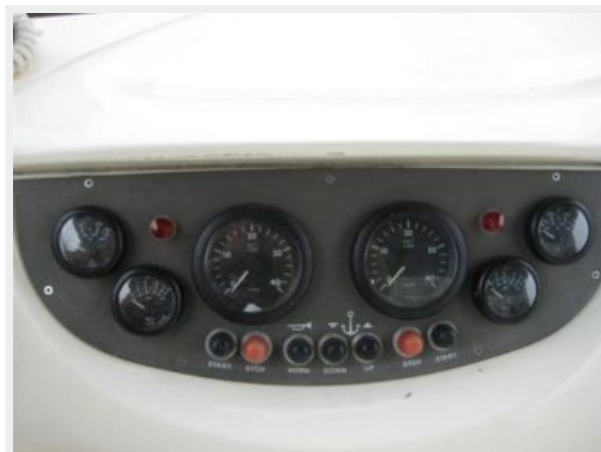
Flybridge Instrument Panel