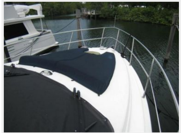
Forward Deck Sunpad