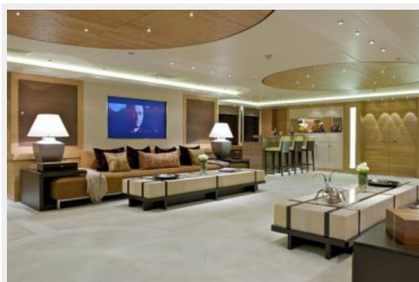
ARKLEY - Main saloon