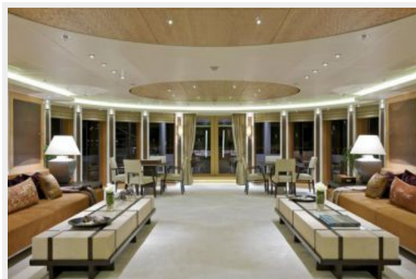
ARKLEY - Interior