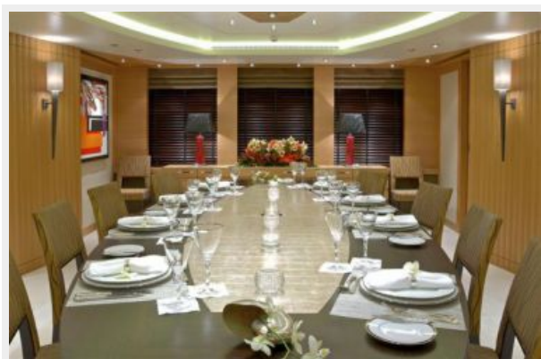
ARKLEY - Dinning