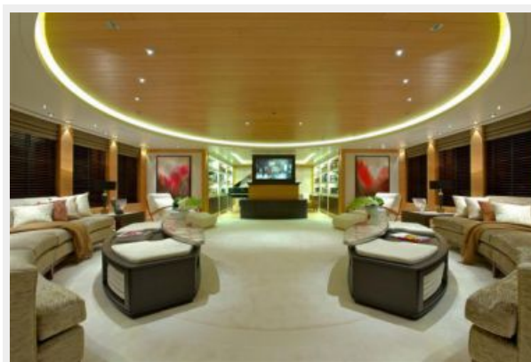
ARKLEY - Interior