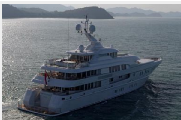
ARKLEY - General line from aft