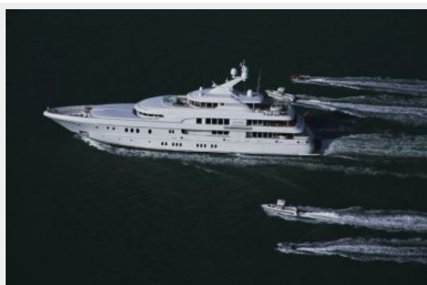
ARKLEY - Toys surrounding