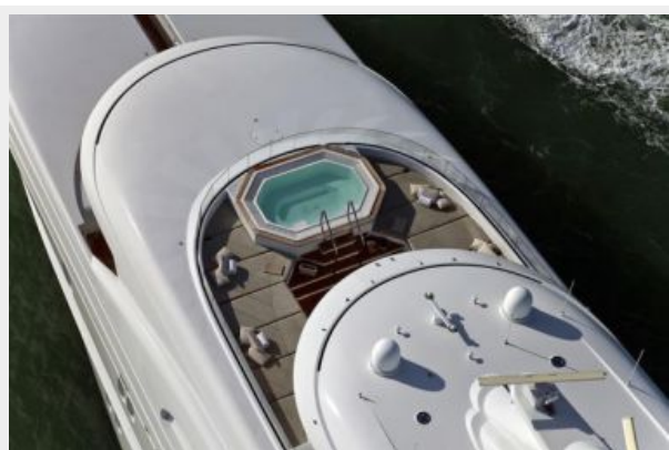
ARKLEY - Jacuzzi