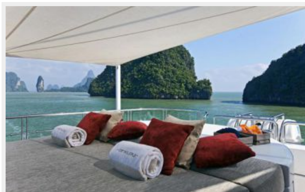
ARKLEY - Exterior