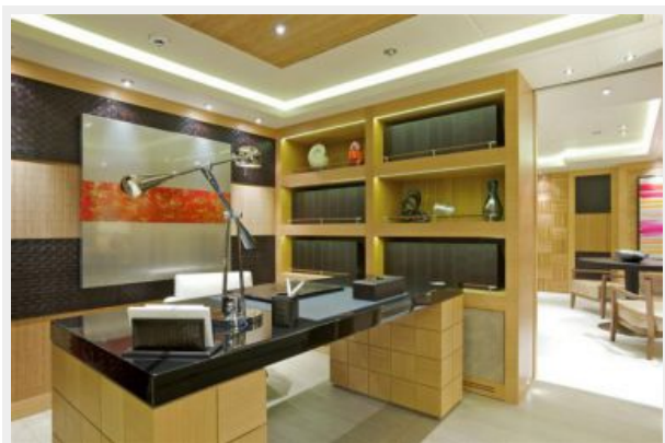
ARKLEY - Owner office