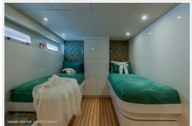
Guest Stateroom Port