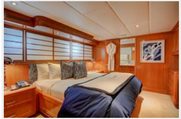
King Guest Stateroom