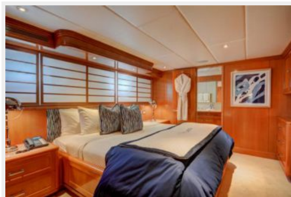
King Guest Stateroom