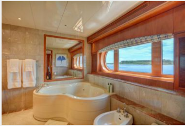
His & Her Master Bath