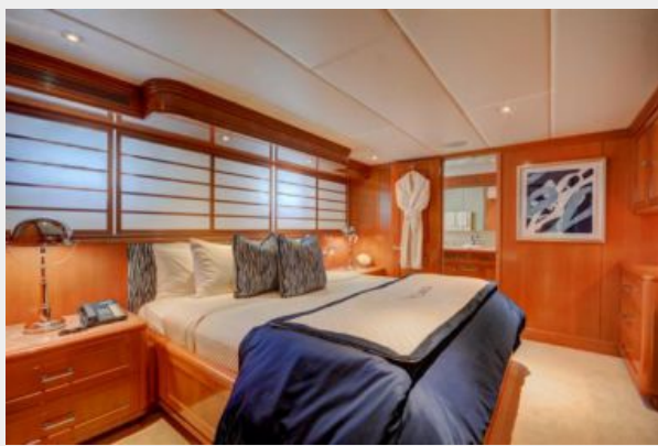
King Guest Stateroom, Starboard