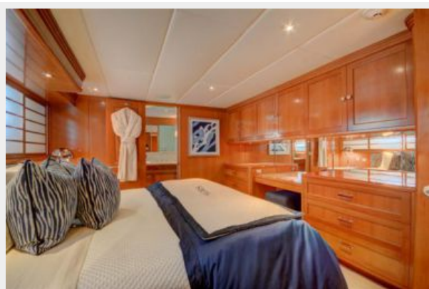
King Guest Stateroom, Port