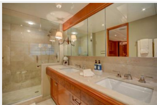
King Guest Bath