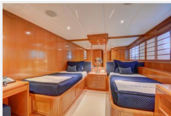
Twin Guest Stateroom, Port