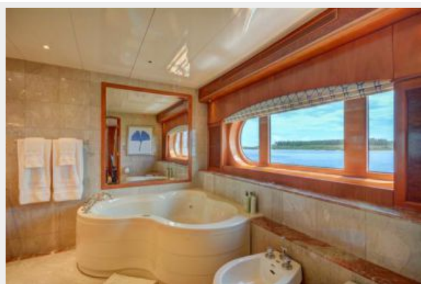
His & Her Master Bath