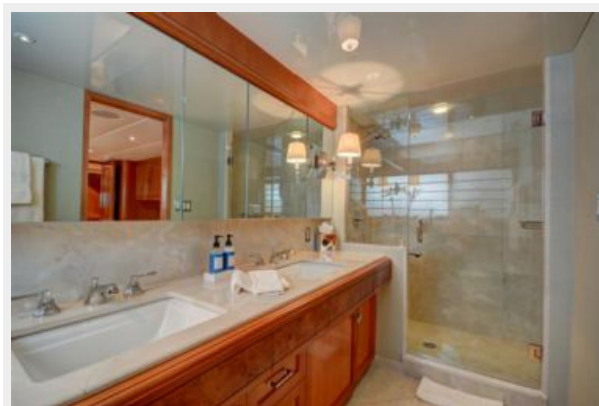
King Guest Head