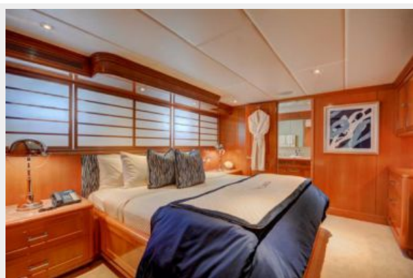
King Guest Stateroom, Starboard