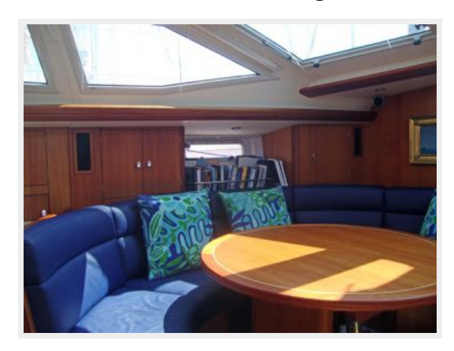
Main Salon Dining