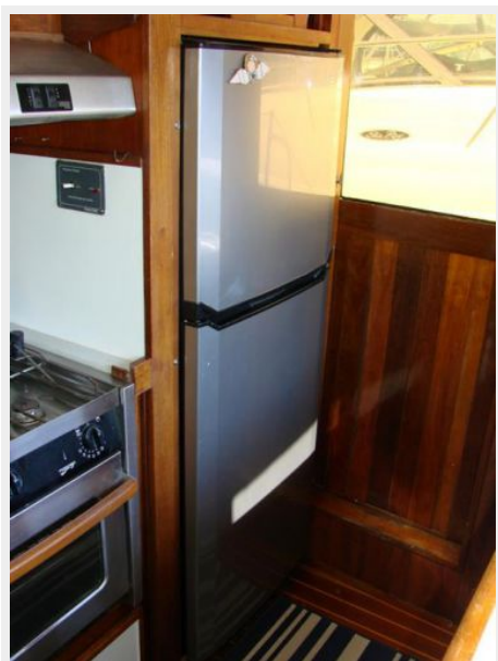
40' Lindsey Galley Photo3