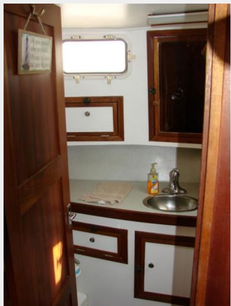
40' Lindsey Head