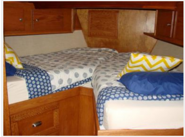
40' Lindsey Stateroom