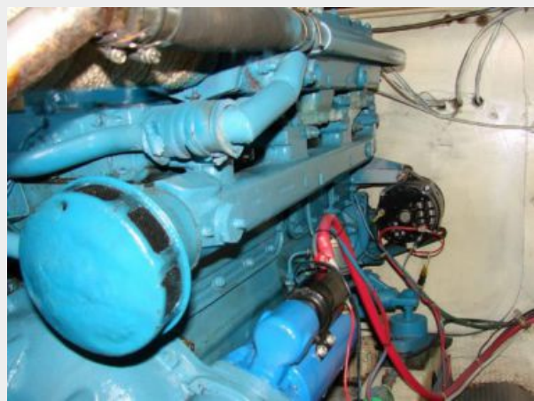
40' Lindsey Main Engine Photo2