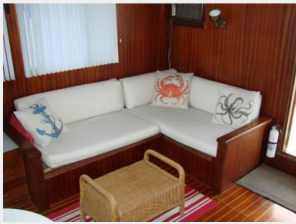
40' Lindsey Salon Seating