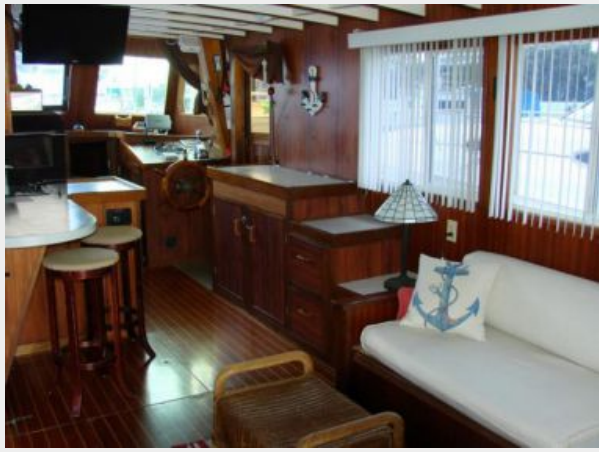
40' Lindsey Salon Forward Photo2