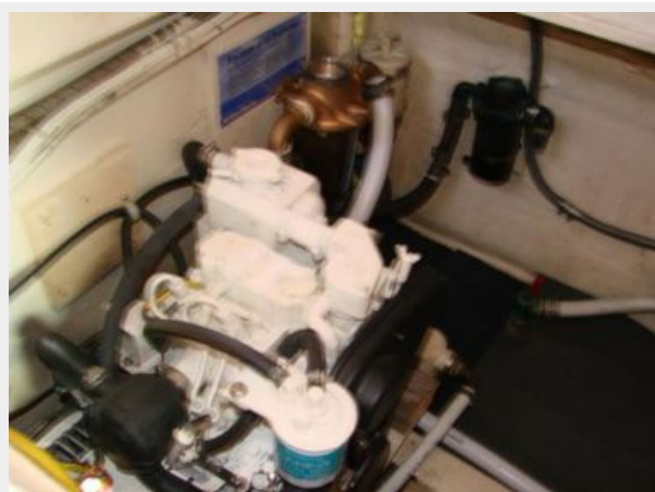
40' Lindsey Generator