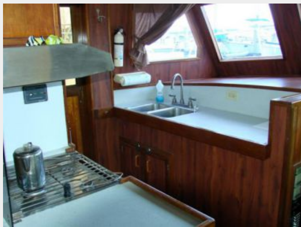
40' Lindsey Galley Photo1