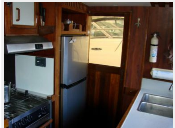
40' Lindsey Galley Photo2