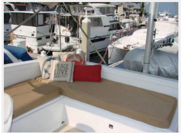
40' Lindsey Flybridge Seating