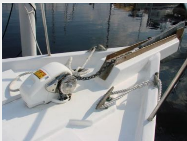
40' Lindsey Anchor Windlass