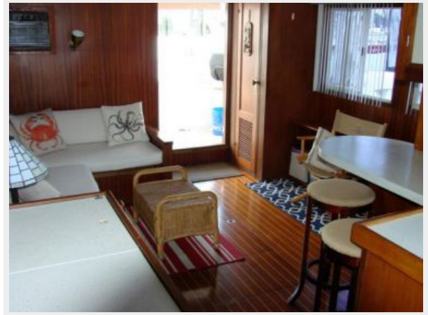
40' Lindsey Saloon Aft