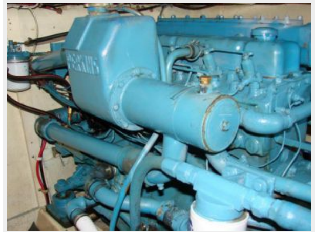
40' Lindsey Main Engine Photo1