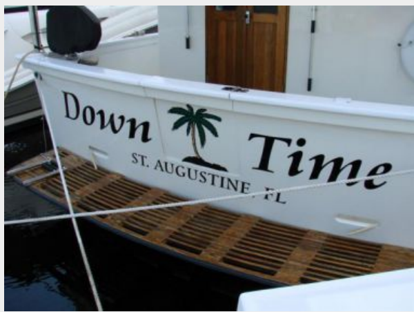
40' Lindsey Swimplatform