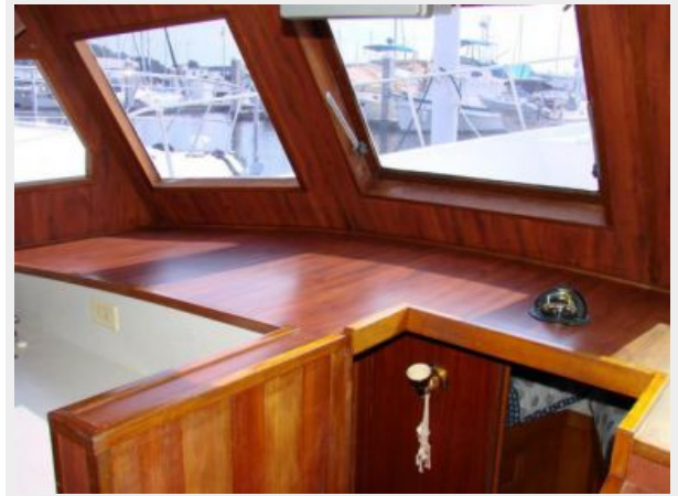
40' Lindsey Lower Helm Counter