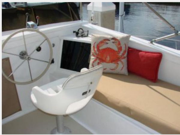
40' Lindsey Flybridge Starboard