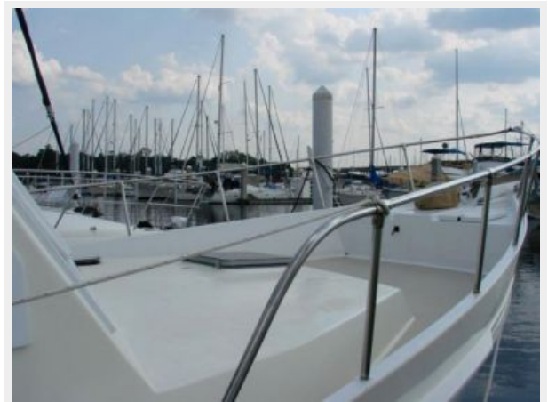
40' Lindsey Foredeck