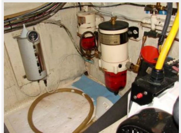
40' Lindsey Fuel Filter