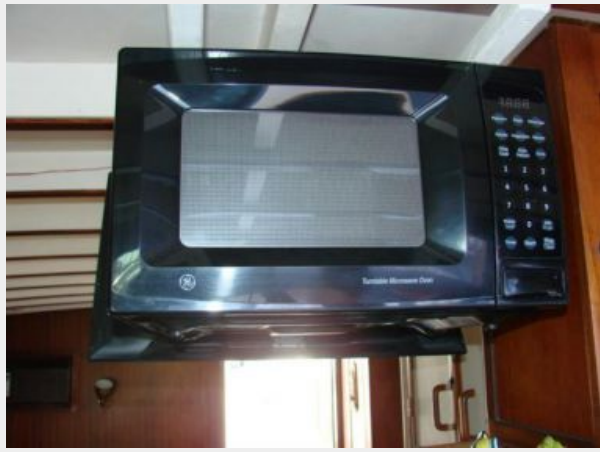
40' Lindsey Microwave