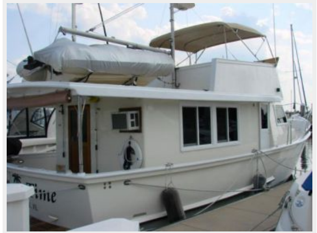
40' Lindsey Starboard Aft Profile