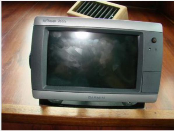
40' Lindsey Lower Helm GPS