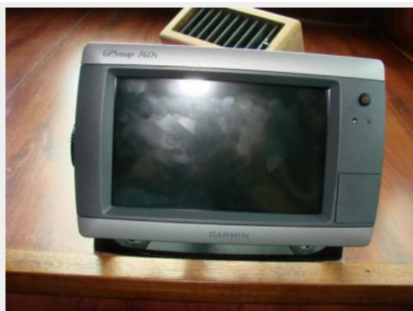
40' Lindsey Lower Helm GPS