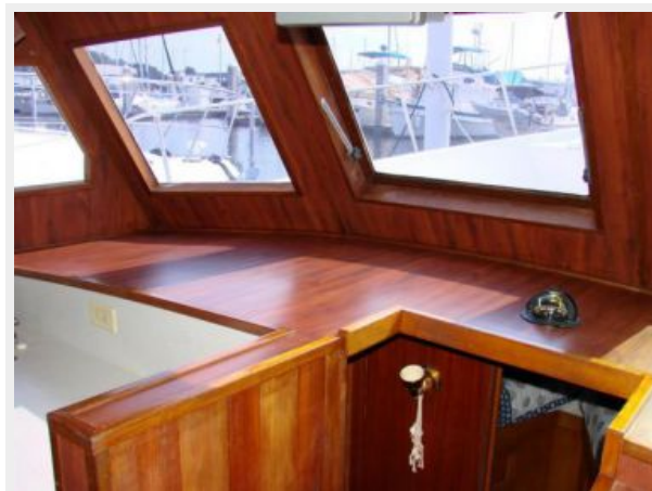
40' Lindsey Lower Helm Counter