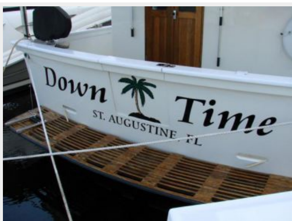
40' Lindsey Swimplatform