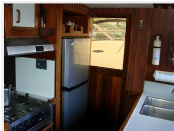
40' Lindsey Galley Photo2