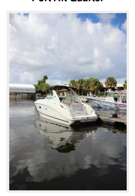
Port Aft Quarter