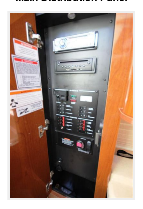
Main Distribution Panel