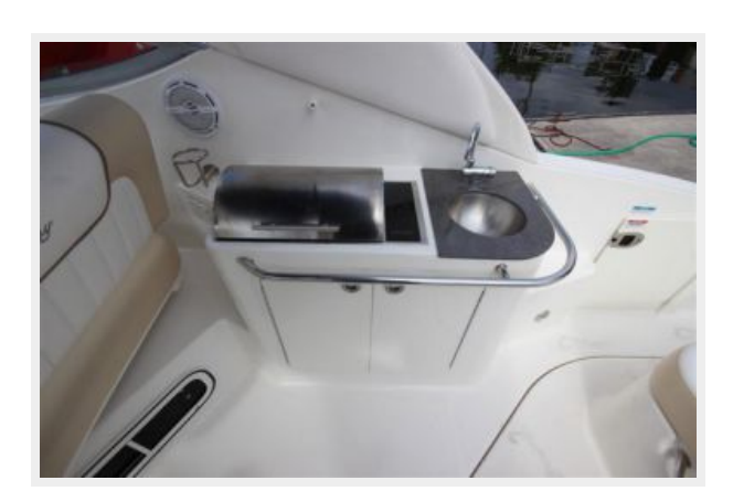
Grill & Wetbar