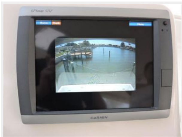
Garmin 12" MFD