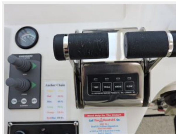
Electronic Engine Controls