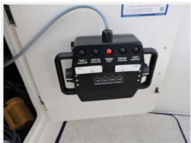
Wired Docking Control