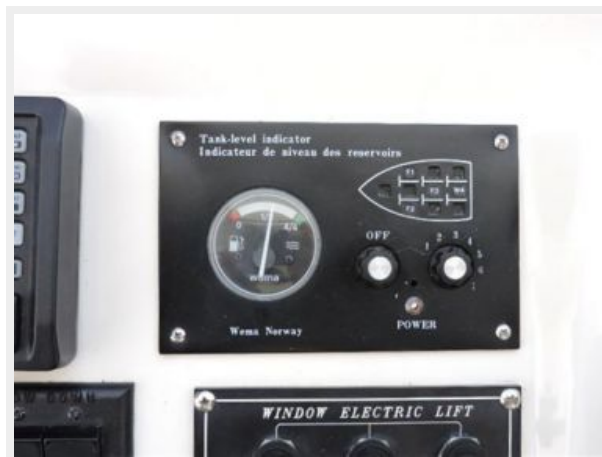
Wema Tank Level Gauge