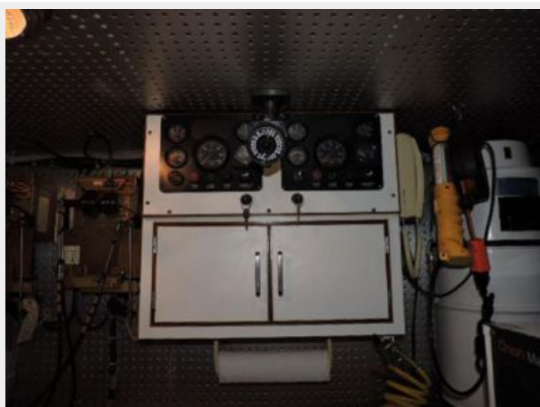
Engine Room Controls