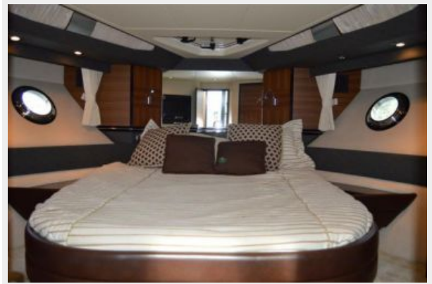
Master (Forward) Stateroom