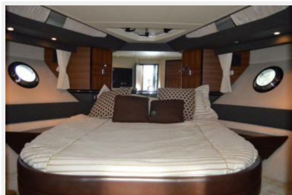
Master (Forward) Stateroom