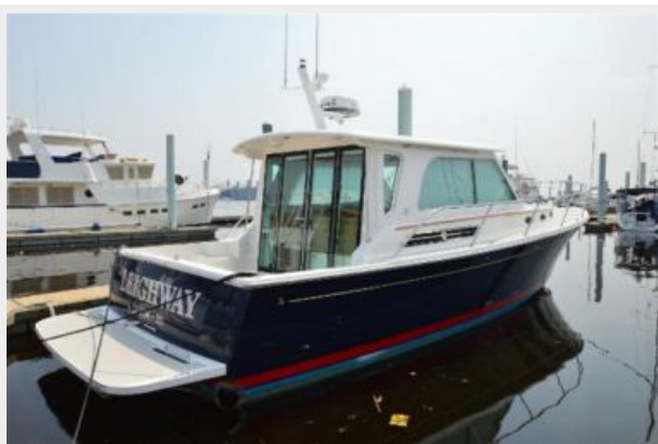
Starboard Aft Side