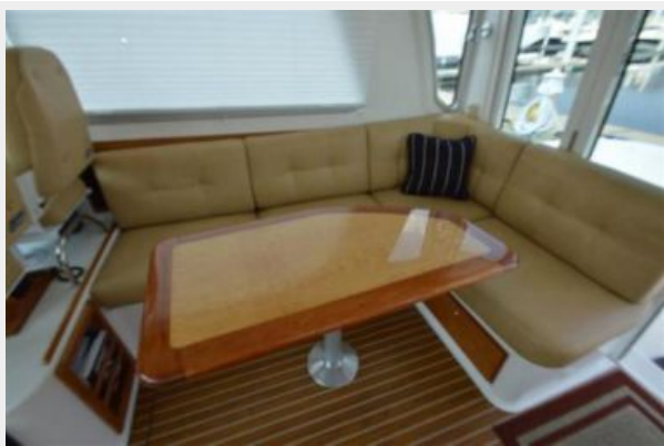
Starboard Side L-Shaped Settee