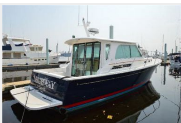
Starboard Aft Side