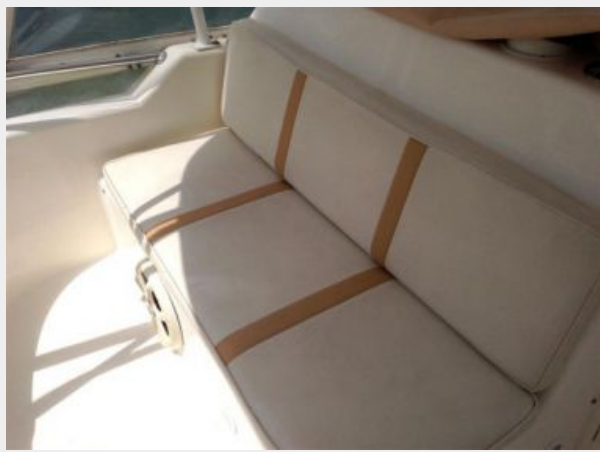
Flybridge - Forward Bench