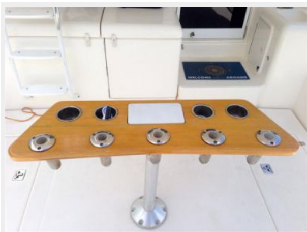
Varnished Rocket Launcher