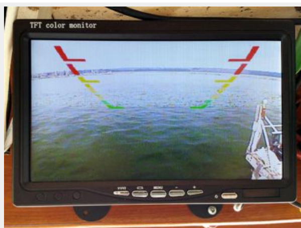
49' Marine Trader Aft Camera Monitor