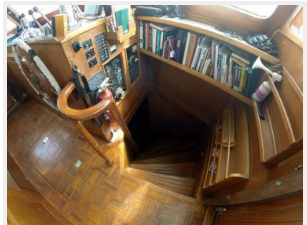
49' Marine Trader Pilothouse Companionway