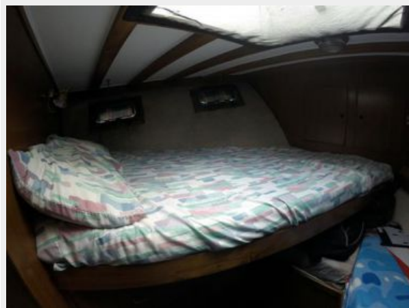
49' Marine Trader Guest Stateroom Port