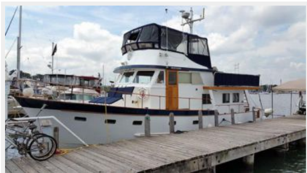
49' Marine Trader Port Forward Profile