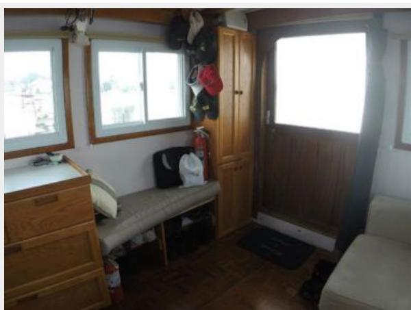
49' Marine Trader Salon Starboard Aft