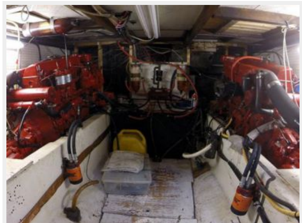
49' Marine Trader Engine Room Forward