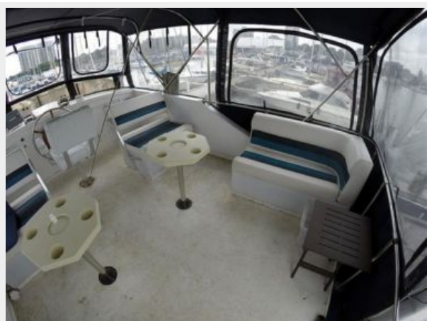
49' Marine Trader Flybridge Starboard