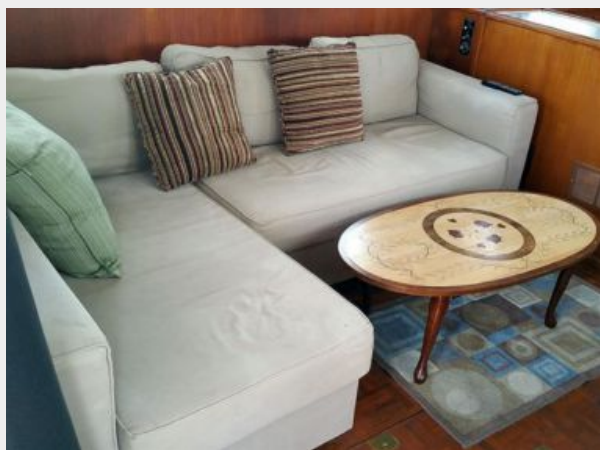
49' Marine Trader Salon Sofa Sleeper