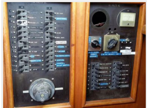
49' Marine Trader Electrical Panel