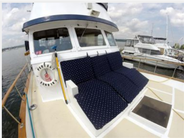
49' Marine Trader Foredeck Seating