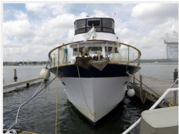
49' Marine Trader Forward Profile