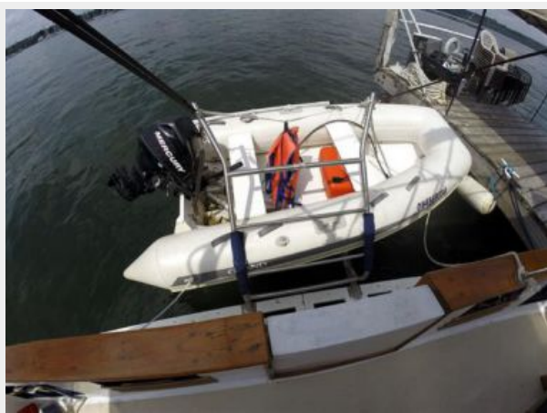
49' Marine Trader Tender