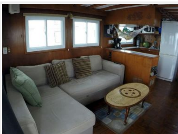
49' Marine Trader Salon Port Seating