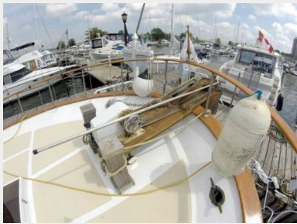
49' Marine Trader Anchor Windlass