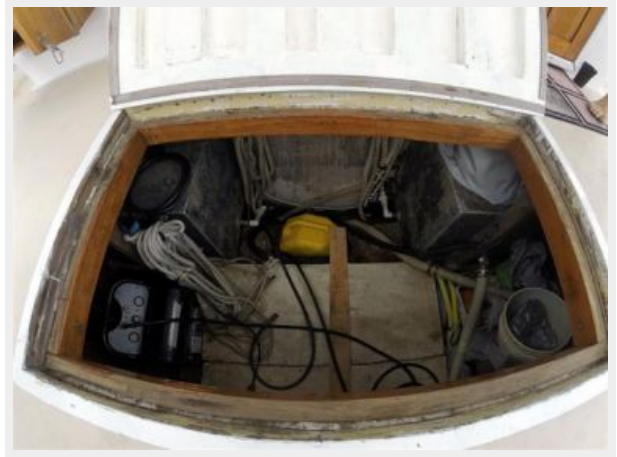
49' Marine Trader Lazarette