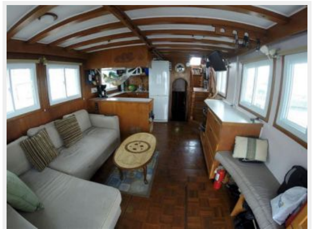
49' Marine Trader Salon Forward