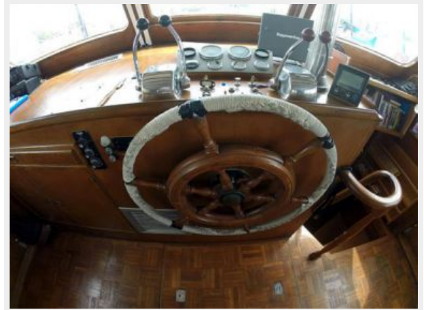
49' Marine Trader Pilothouse Helm photo2