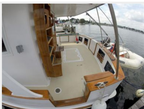
49' Marine Trader Aftdeck Starboard