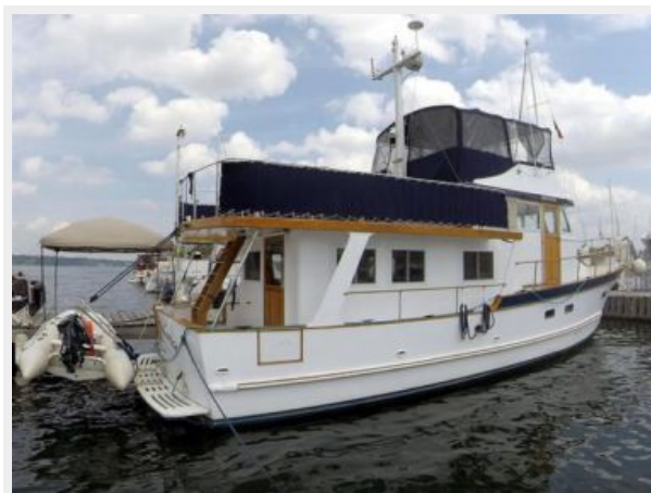
49' Marine Trader Starboard Aft Profile