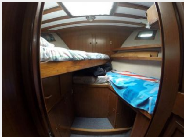
49' Marine Trader Guest Stateroom