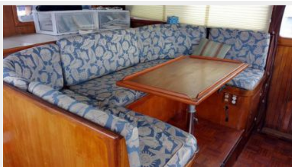
49' Marine Trader Pilothouse Settee