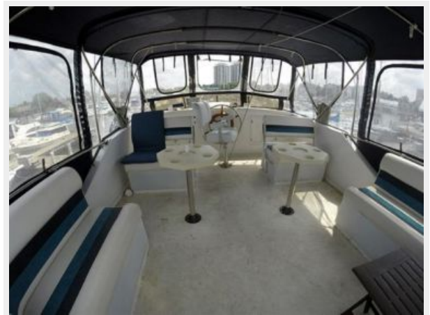
49' Marine Trader Flybridge Forward