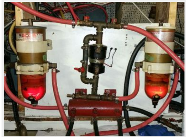
49' Marine Trader Racor Fuel Filters