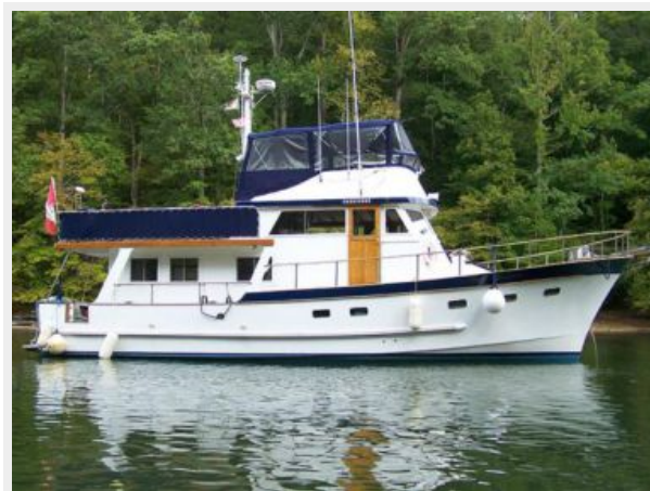
49' Marine Trader Starboard Profile