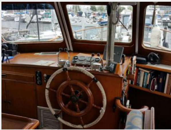
49' Marine Trader Pilothouse Helm photo1