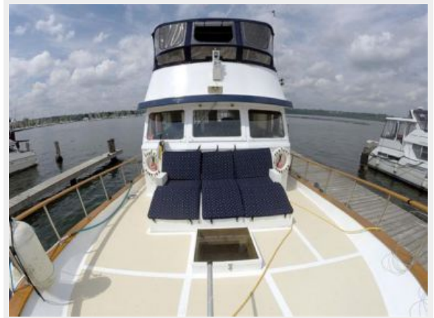
49' Marine Trader Foredeck Aft