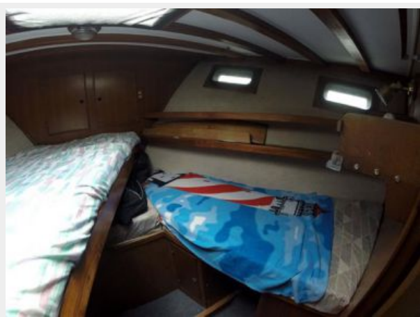
49' Marine Trader Guest Stateroom Starboard