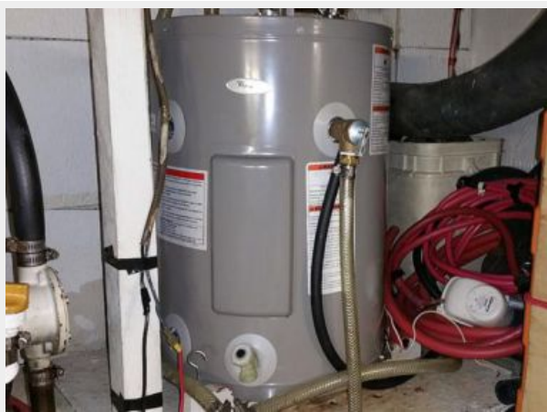
49' Marine Trader Water Heater