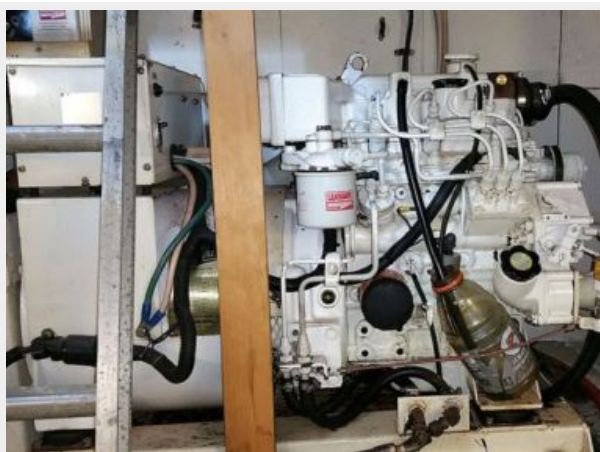
49' Marine Trader Generator