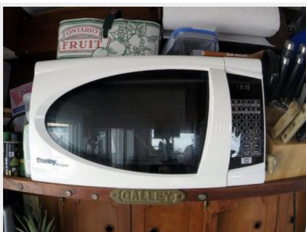
49' Marine Trader Galley Microwave