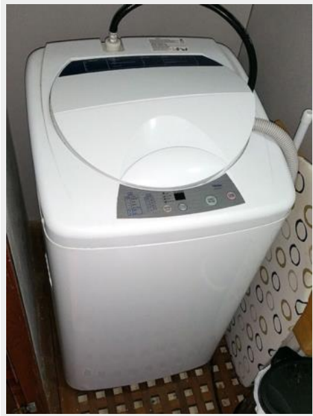
49' Marine Trader Washer