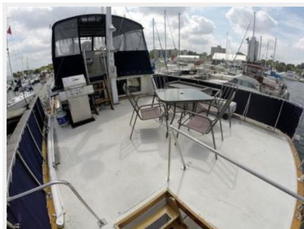
49' Marine Trader Sundeck Forward