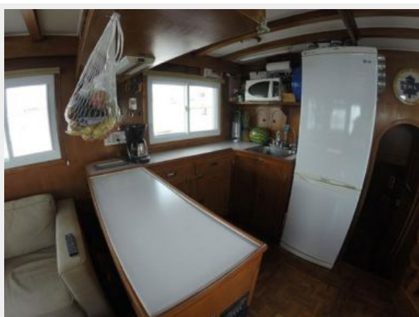
49' Marine Trader Galley photo1