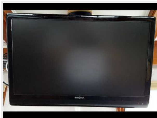
49' Marine Trader Salon TV