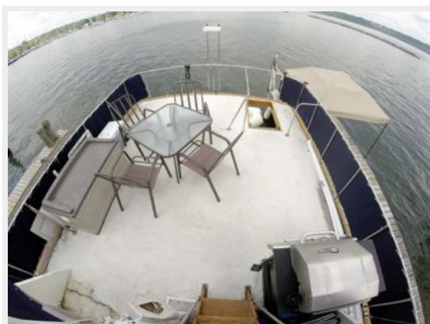
49' Marine Trader Sundeck Aft