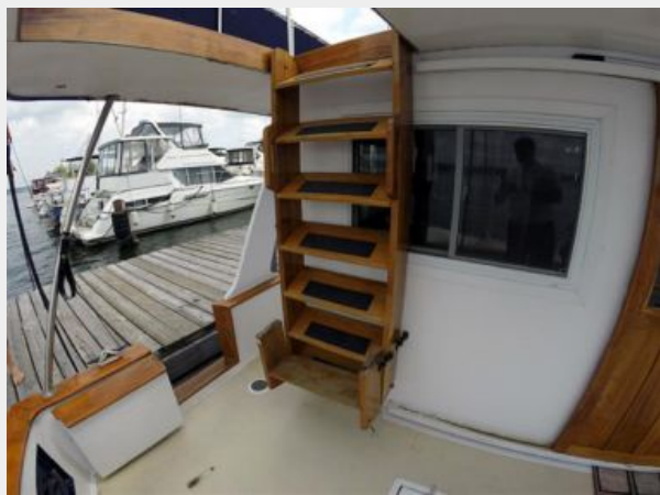
49' Marine Trader Aftdeck-Sundeck Ladder Folded