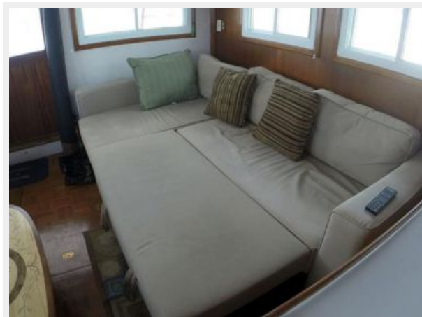
49' Marine Trader Salon Sleeper