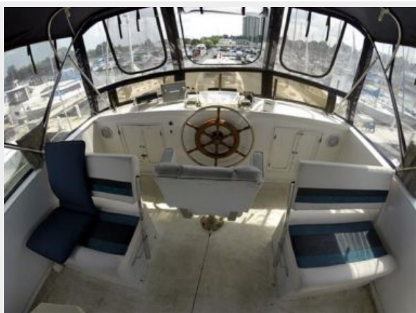
49' Marine Trader Flybridge Helm