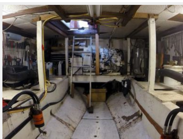
49' Marine Trader Engine Room Aft