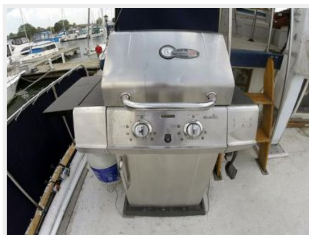
49' Marine Trader Sundeck Grill