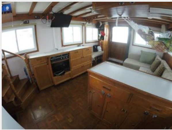
49' Marine Trader Galley photo3