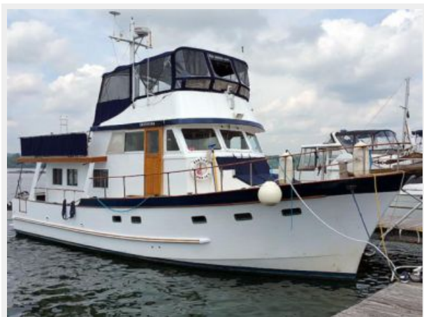
49' Marine Trader Starboard Forward Profile