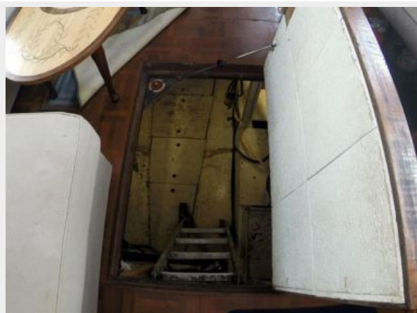
49' Marine Trader Engine Room Access