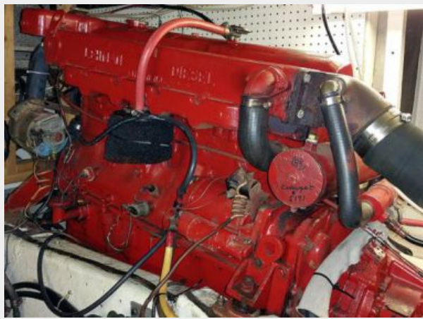
49' Marine Trader Starboard Main Engine