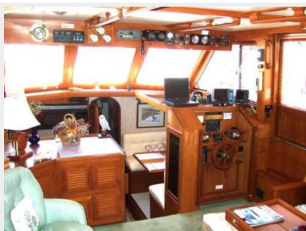
Lower Helm 1