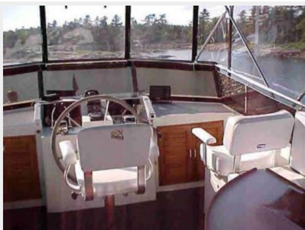
Fly Bridge 1