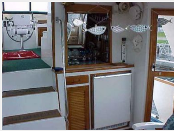
Aft Deck 1