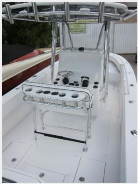
Hard top w/ Aristo blue underside