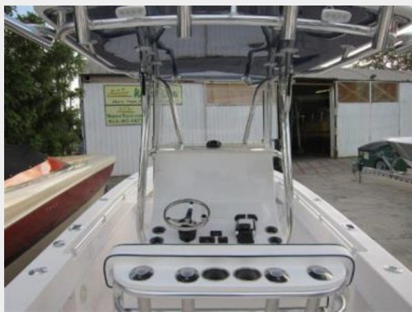
Contender 28 Sport