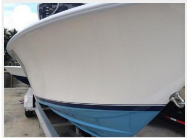
Sky Blue bottom, Aristo blue boot stripe