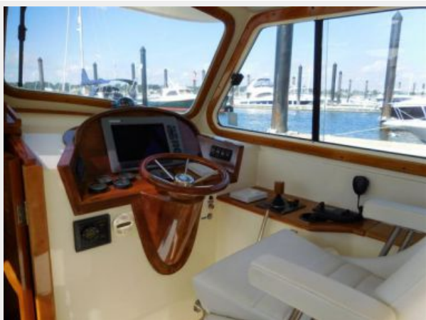
Cockpit helm area