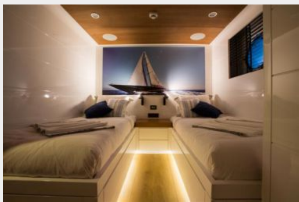
twin guest cabin