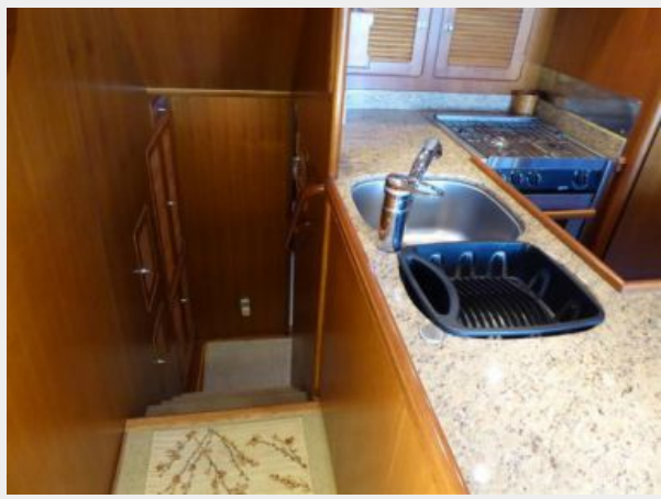
Stairs to cabins