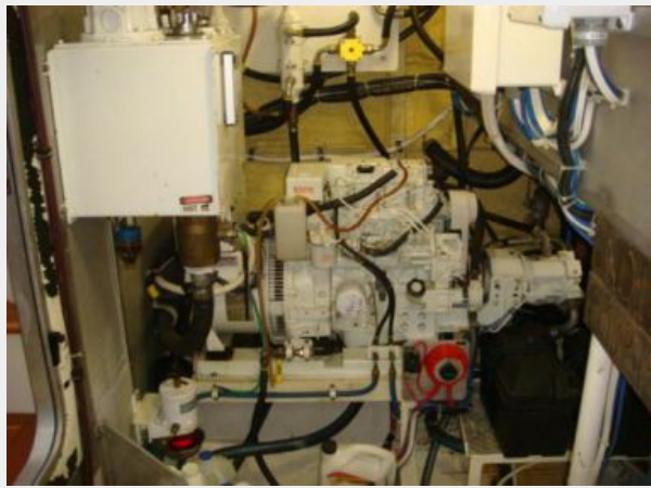
39' Neville Trawler engine room starboard forward