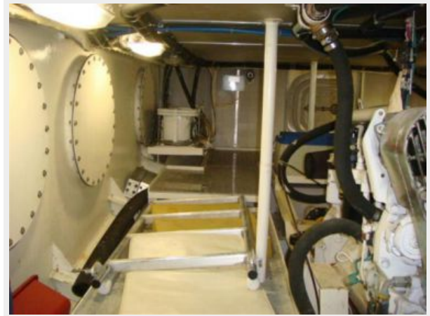
39' Neville Trawler engine room starboard aft