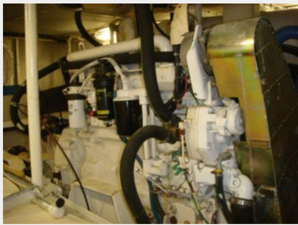
39' Neville Trawler main engine photo1