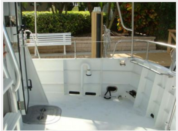
39' Neville Trawler aftdeck starboard