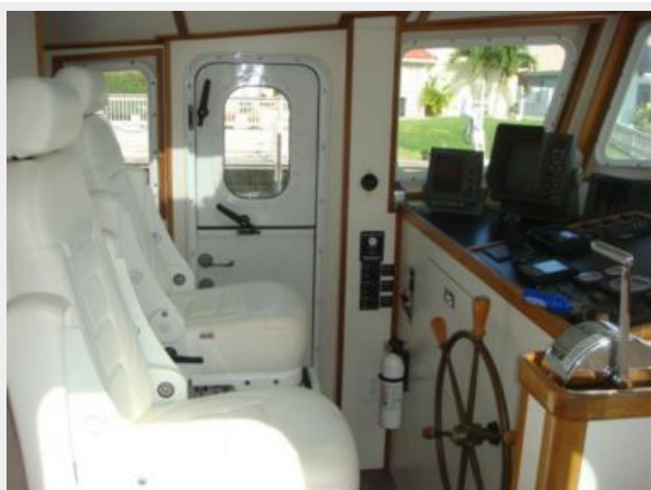
39' Neville Trawler pilothouse port