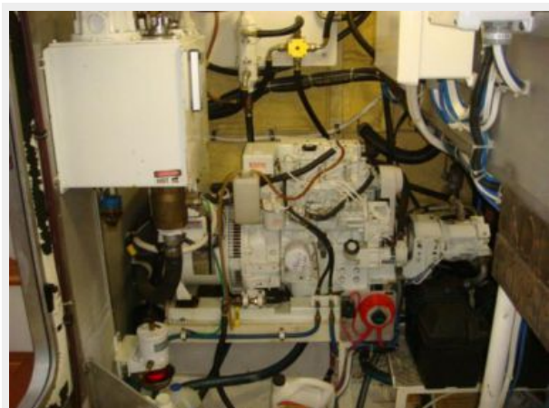
39' Neville Trawler engine room starboard forward