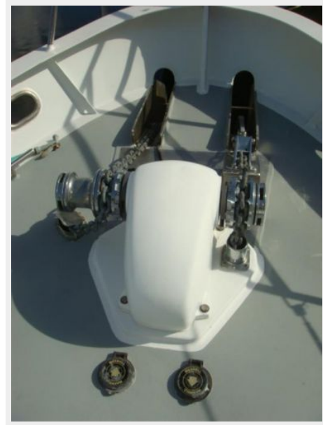
39' Neville Trawler anchor windlass