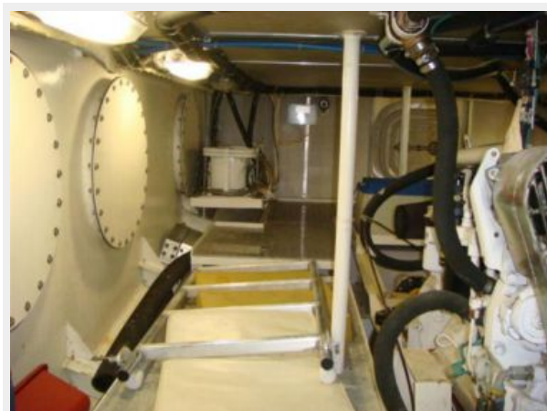
39' Neville Trawler engine room starboard aft