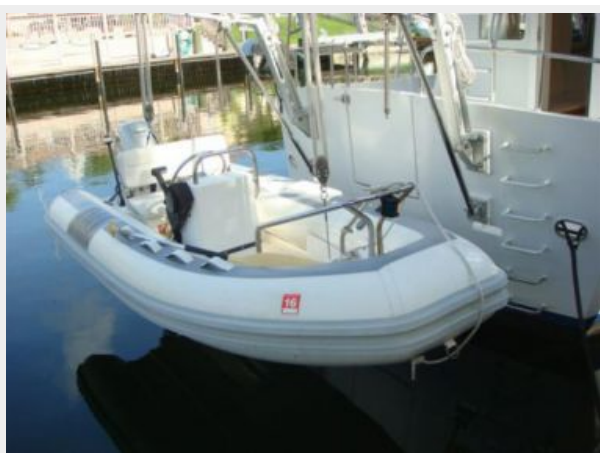
39' Neville Trawler tender