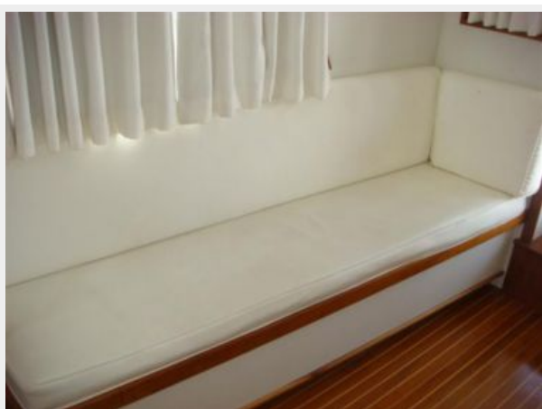
39' Neville Trawler salon starboard seating