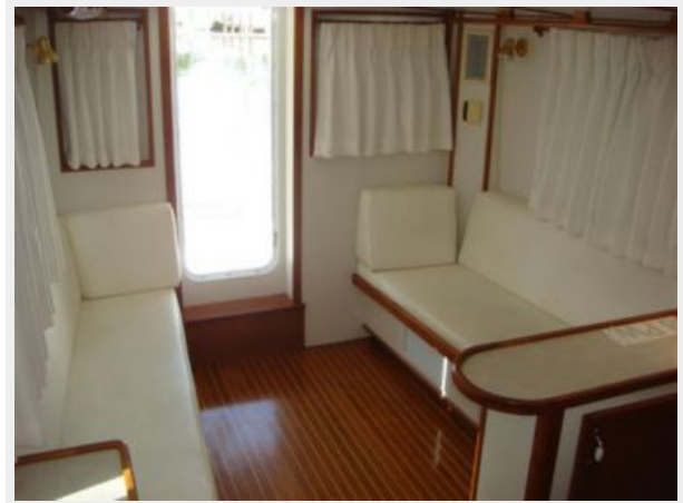
39' Neville Trawler salon aft