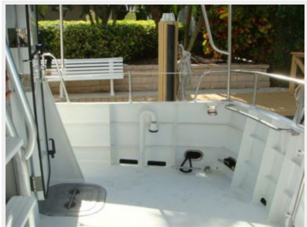
39' Neville Trawler aftdeck starboard