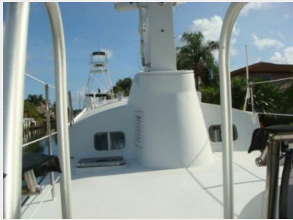
39' Neville Trawler flybridge