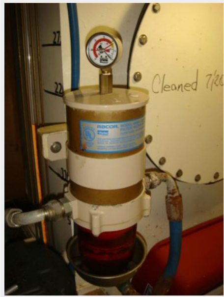
39' Neville Trawler Racor fuel filter