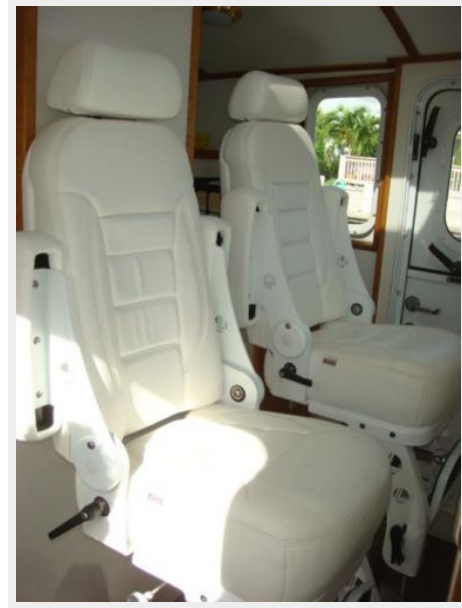
39' Neville Trawler pilothouse helmseats