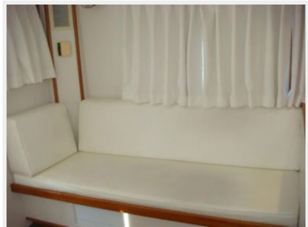
39' Neville Trawler salon port seating