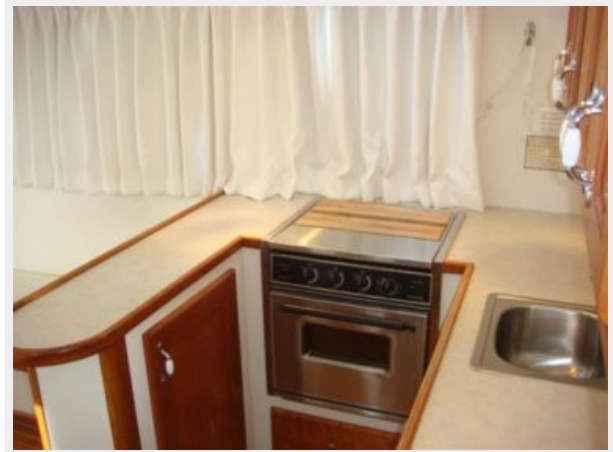
39' Neville Trawler galley photo2