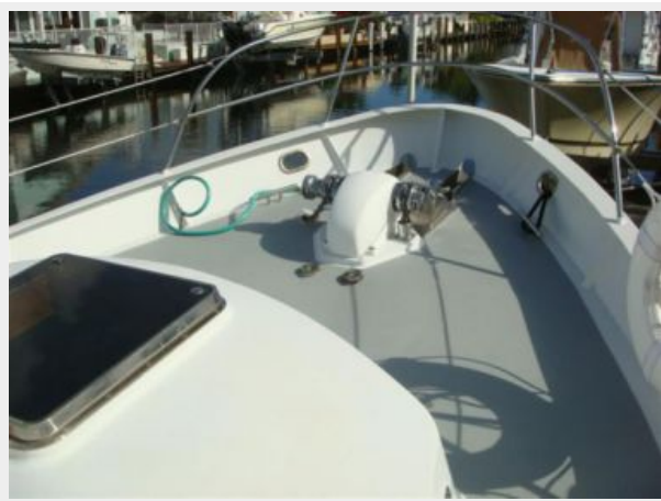
39' Neville Trawler foredeck