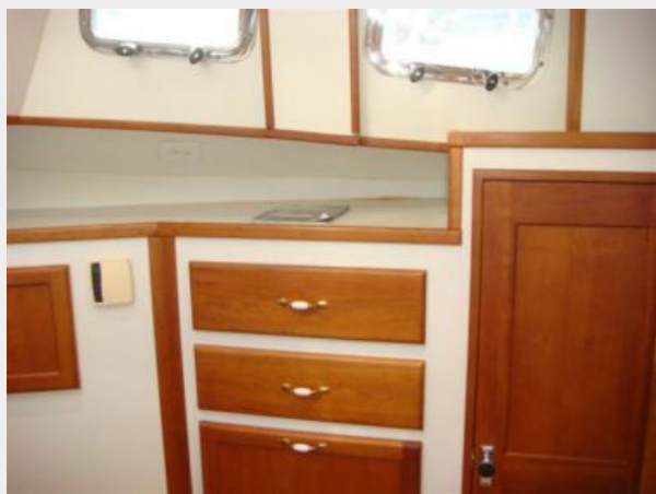
39' Neville Trawler stateroom starboard