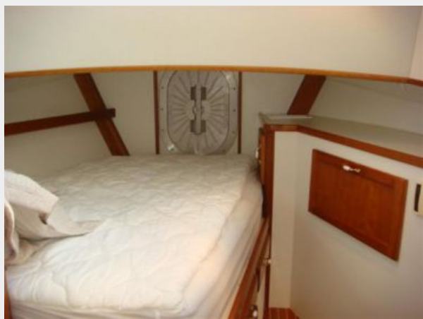
39' Neville Trawler stateroom