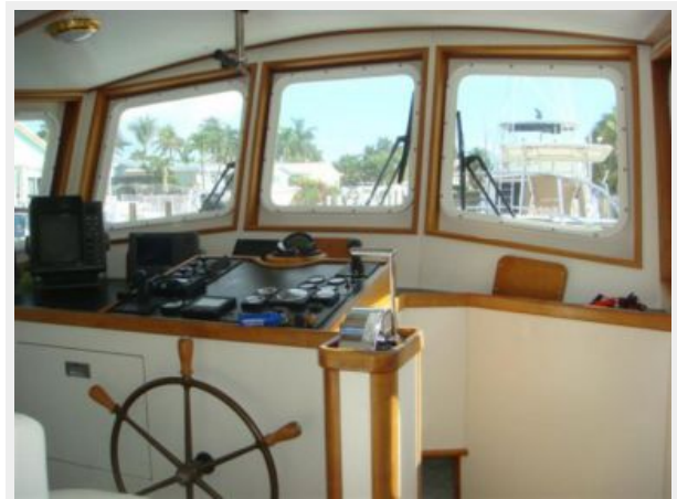
39' Neville Trawler pilothouse forward