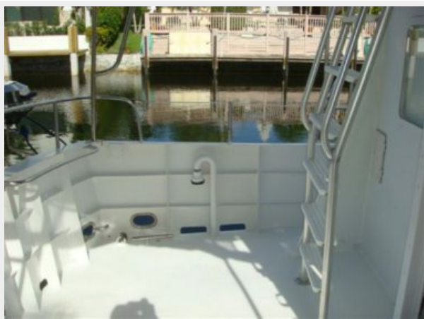
39' Neville Trawler aftdeck port