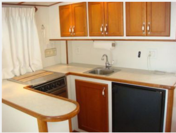
39' Neville Trawler galley photo1