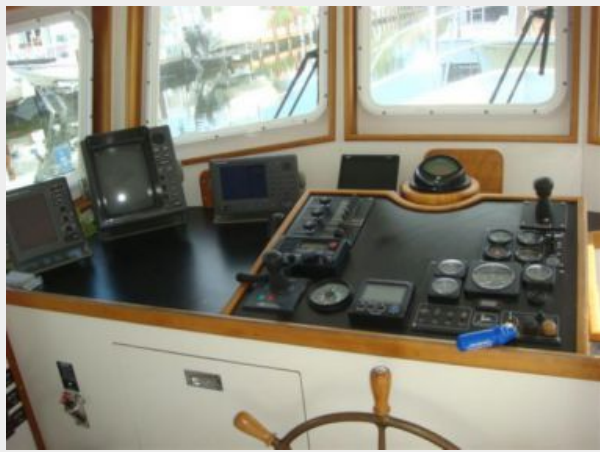
39' Neville Trawler pilothouse helm