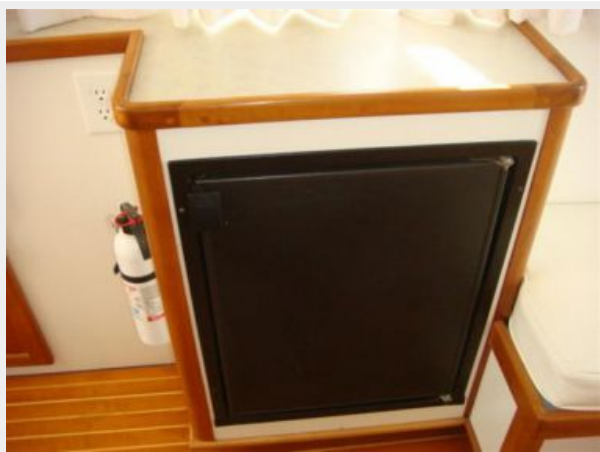
39' Neville Trawler galley freezer