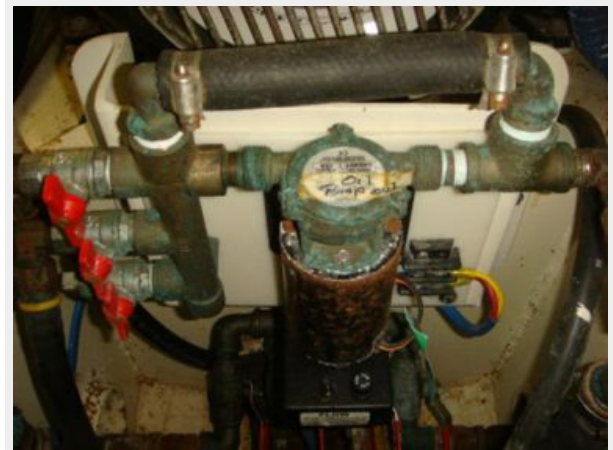
39' Neville Trawler oil change system