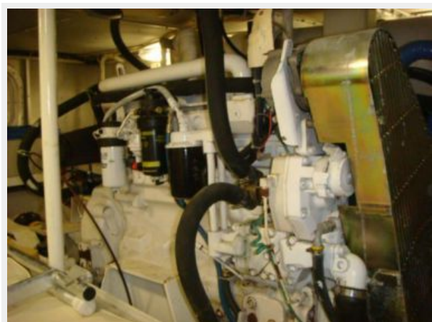
39' Neville Trawler main engine photo1