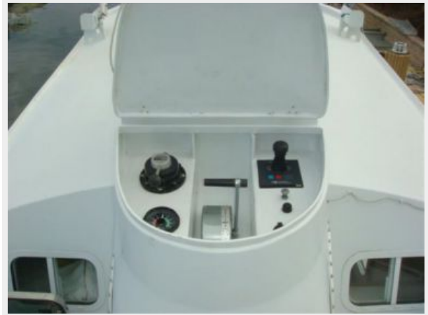
39' Neville Trawler flybridge controls