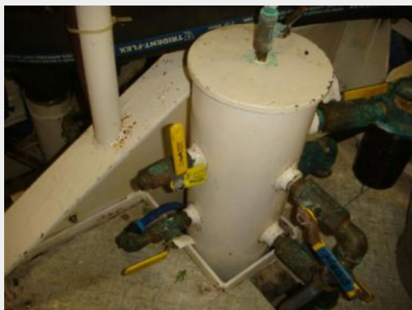
39' Neville Trawler sea chest